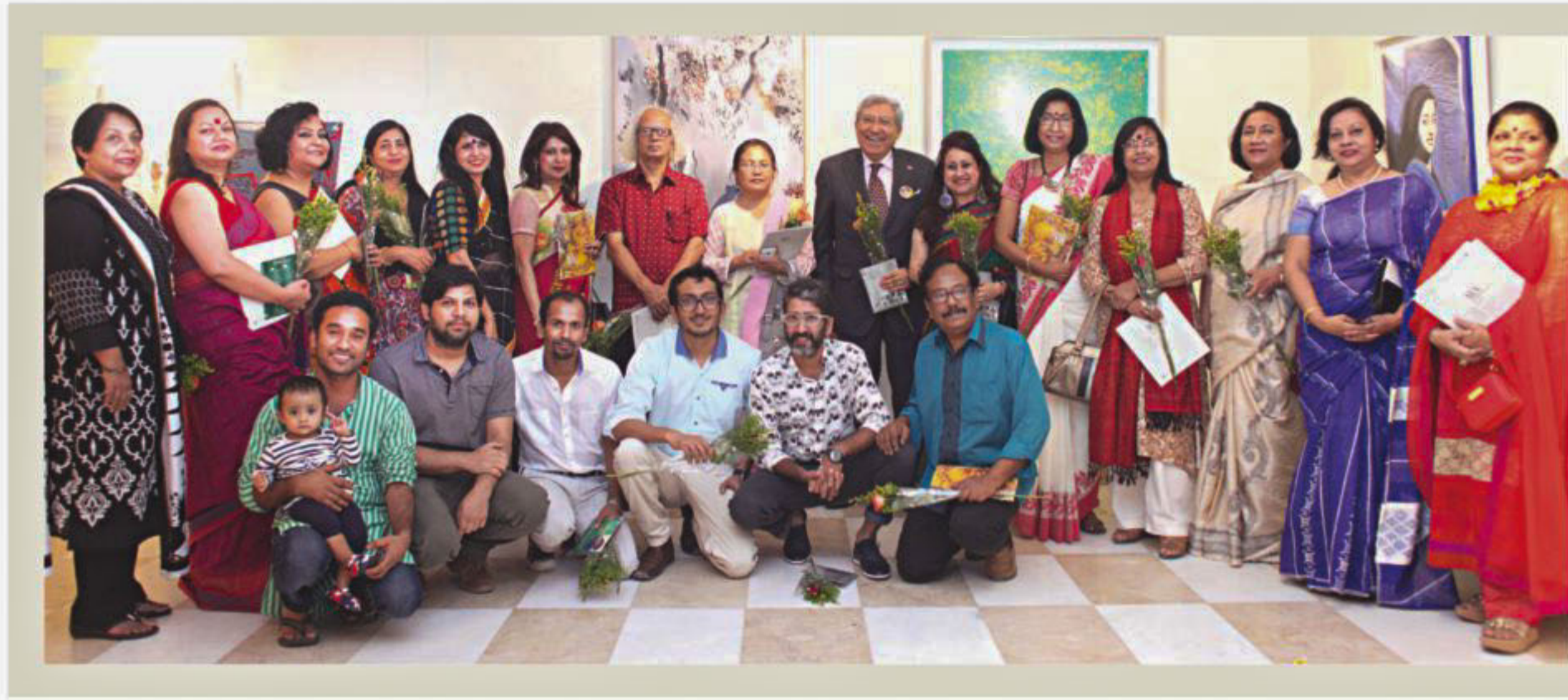
The inaugural of a two-week group art exhibition titled "MA" to celebrate Mother's Day was organised by Gallery Cosmos on May 13 at the Gallery Cosmos. Works of 22 Bangladeshi artists shared wall space at the exhibit. The exhibit is on till June 15.

The eminent art critic received the Bangla Academy Award in 1974. He passed away on January 21, 2010. He was awarded with the Ekushey Padak posthumously on February 21, 2010.