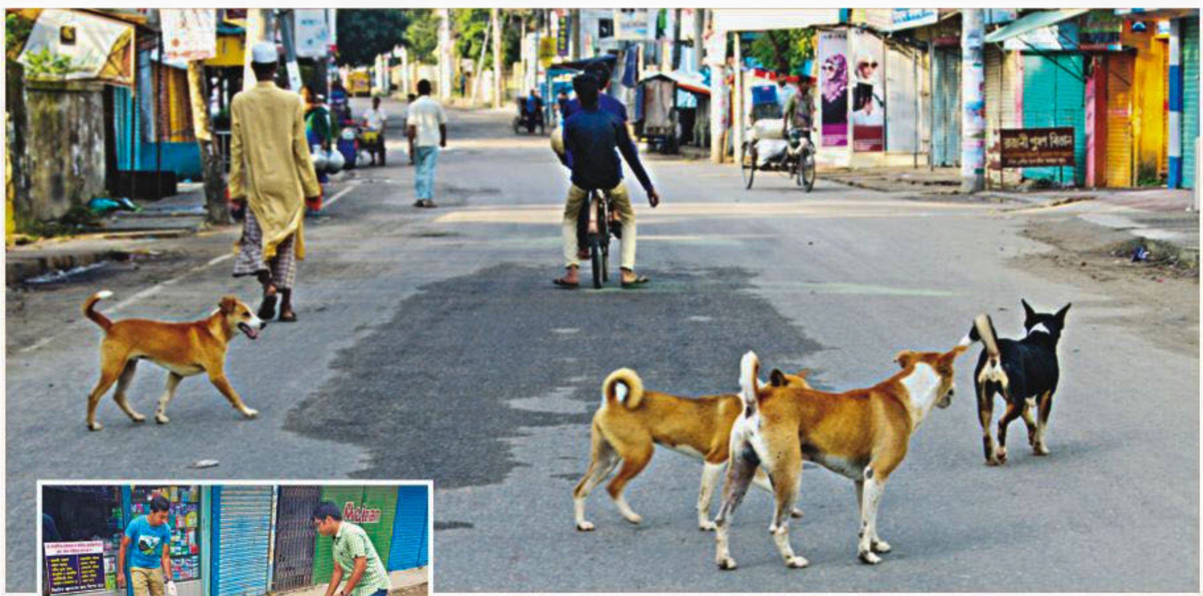
In absence of a proper dog management programme, stray dogs wandering freely on the streets of Sylhet city have become a common scene. Inset, students of Sylhet Agricultural University have recently started de-worming these street dogs.