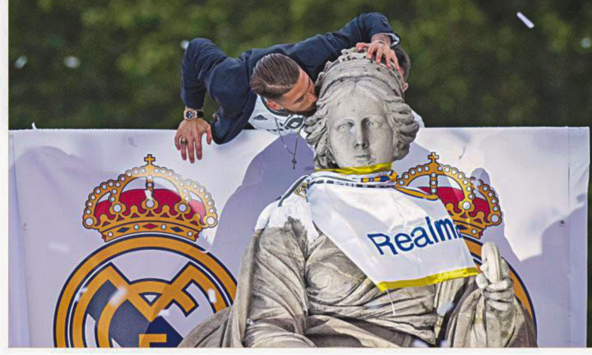
(CLOCKWISE FROM TOP L) Zinedine Zidane is thrown into the air by his jubilant players after their Champions League final win on Saturday. Meanwhile, a distraught Atletico Madrid manager Diego Simeone was once again second best in the final. Real captain Sergio Ramos kisses the Godess of fertility, Cibeles, at the Plaza de Cibeles during Real's trophy parade. And although Cristiano Ronaldo may have been a shadow of himself in the final, it was his decisive spot-kick which earned Real the Undecima.