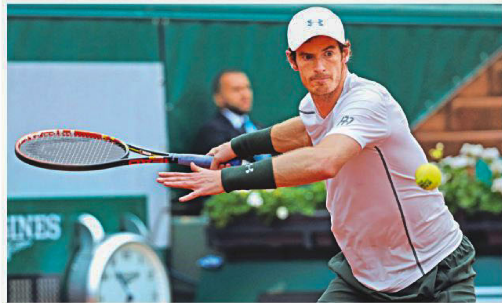
British world number 2 Andy Murray overcame the threat of big-serving American John Isner in straight sets at the Roland Garros yesterday to move into the French Open quarterfinals.

It was Wawrinka's fifth win in five meetings with Troicki whose challenge fizzled out after he required treatment for a right thigh injury at 4-1 down in the third set.