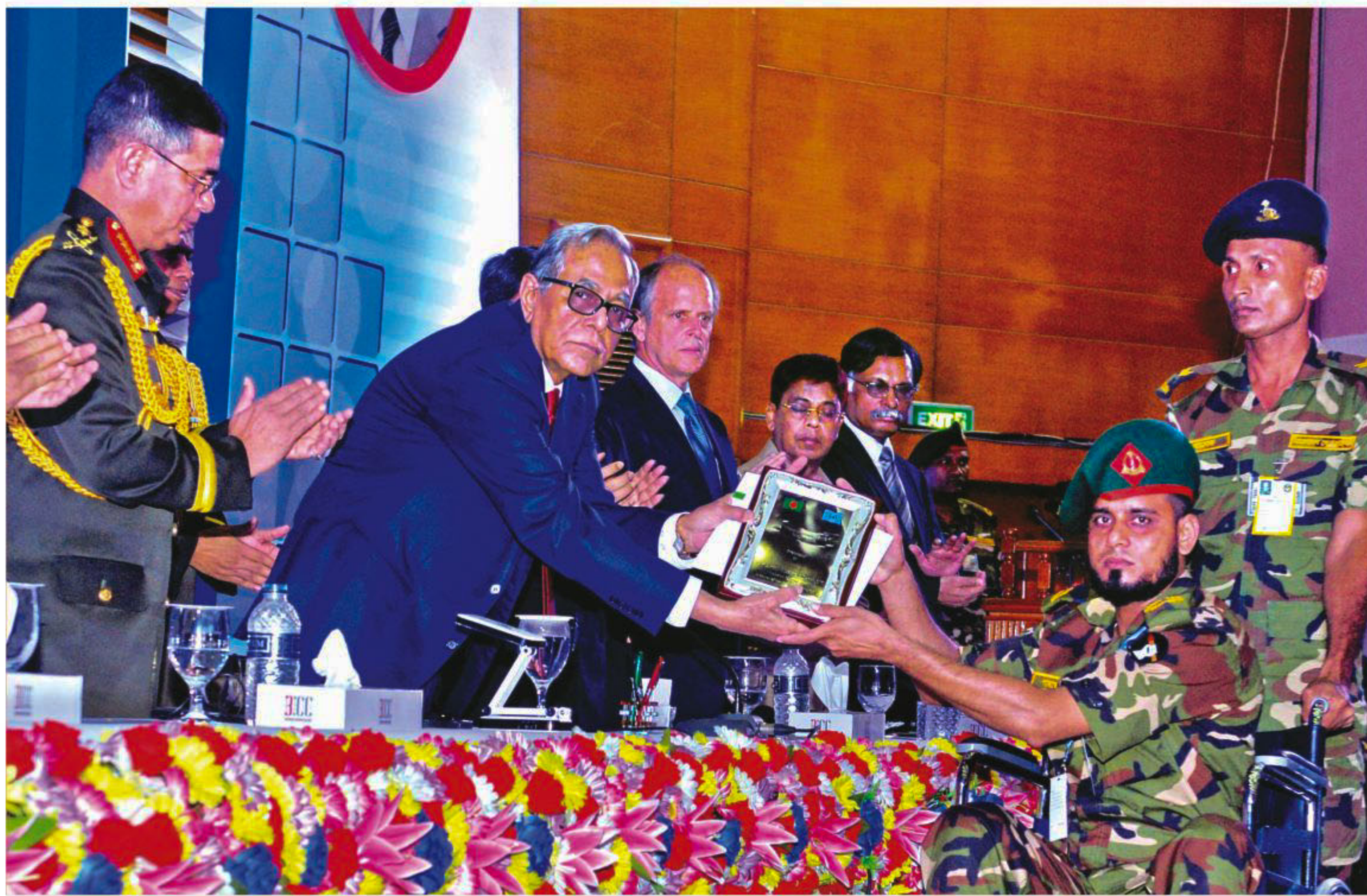
President Abdul Hamid hands over an award to an injured Bangladeshi peacekeeper at a programme marking International Day of UN Peacekeepers 2016 in the capital's Bangabandhu International Conference Centre yesterday. Twenty-nine other injured and the families of six peacekeepers killed during their duties in UN peacekeeping missions also received the awards.