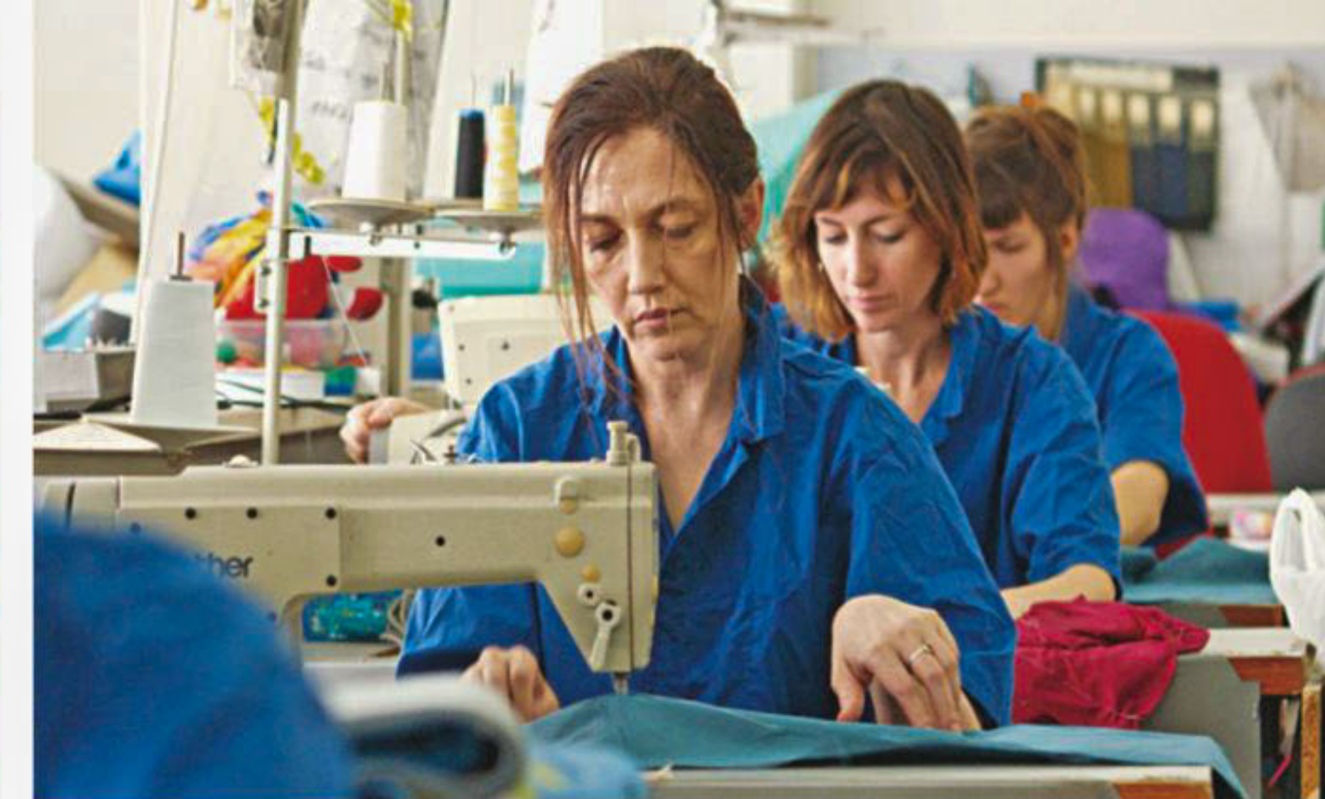
Still From Anna