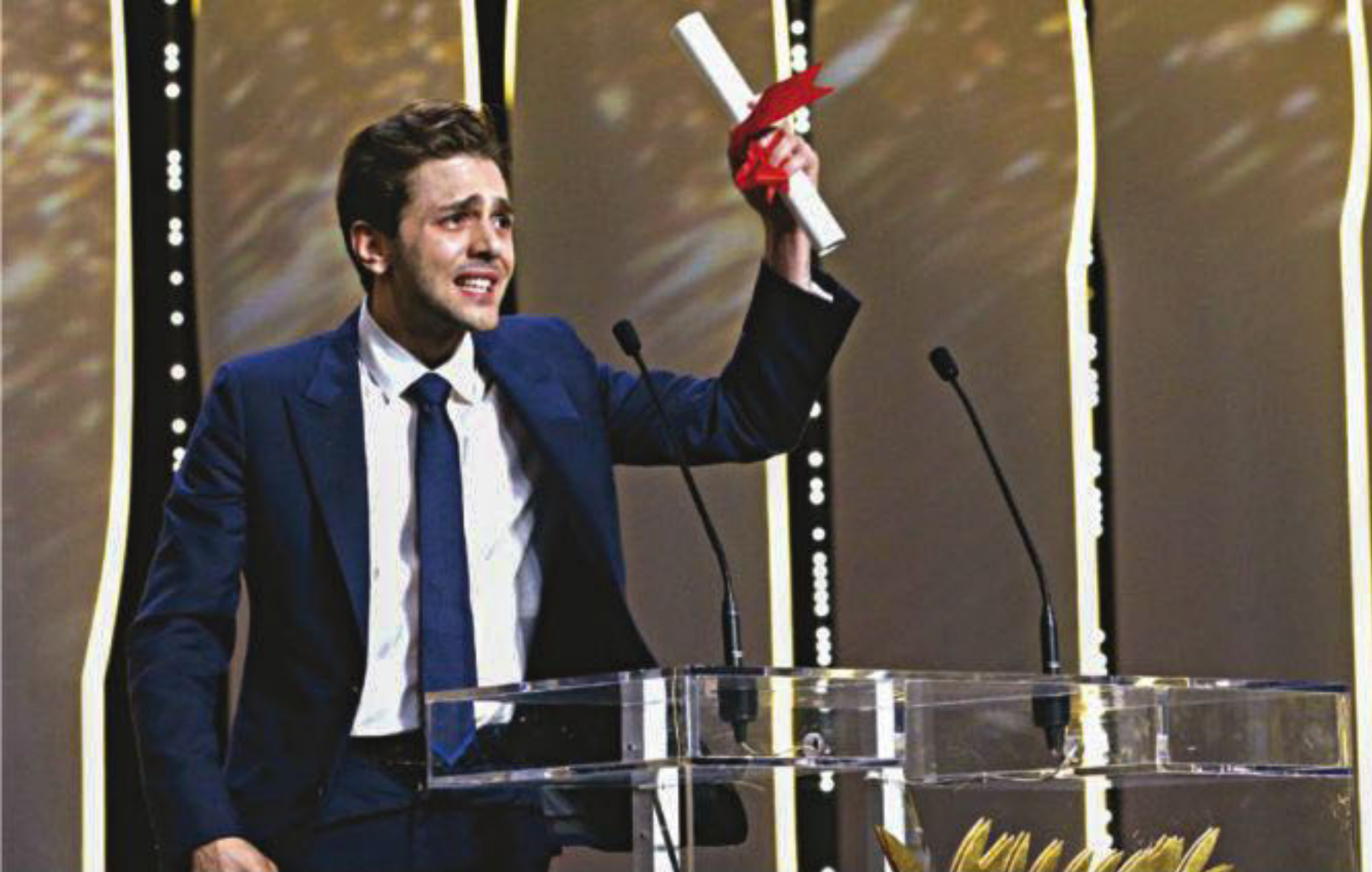
Xavier Dolan, Winner of Grand Prix