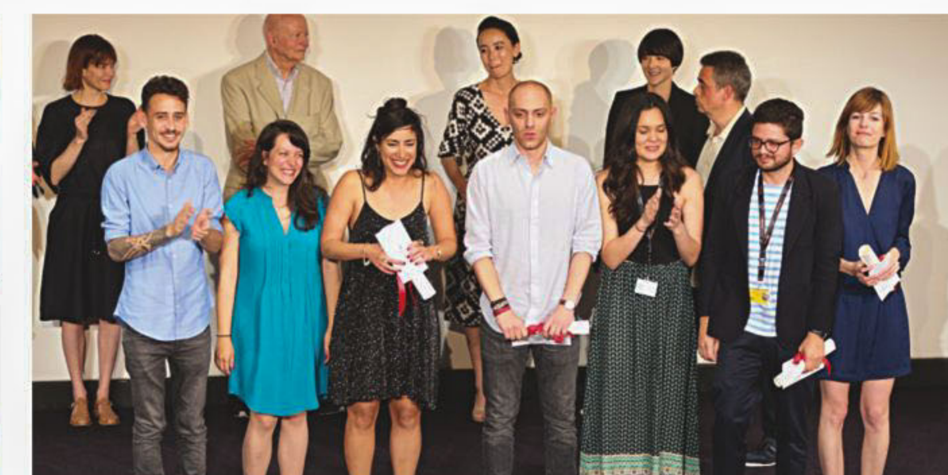
Short Film Winners and the Jury