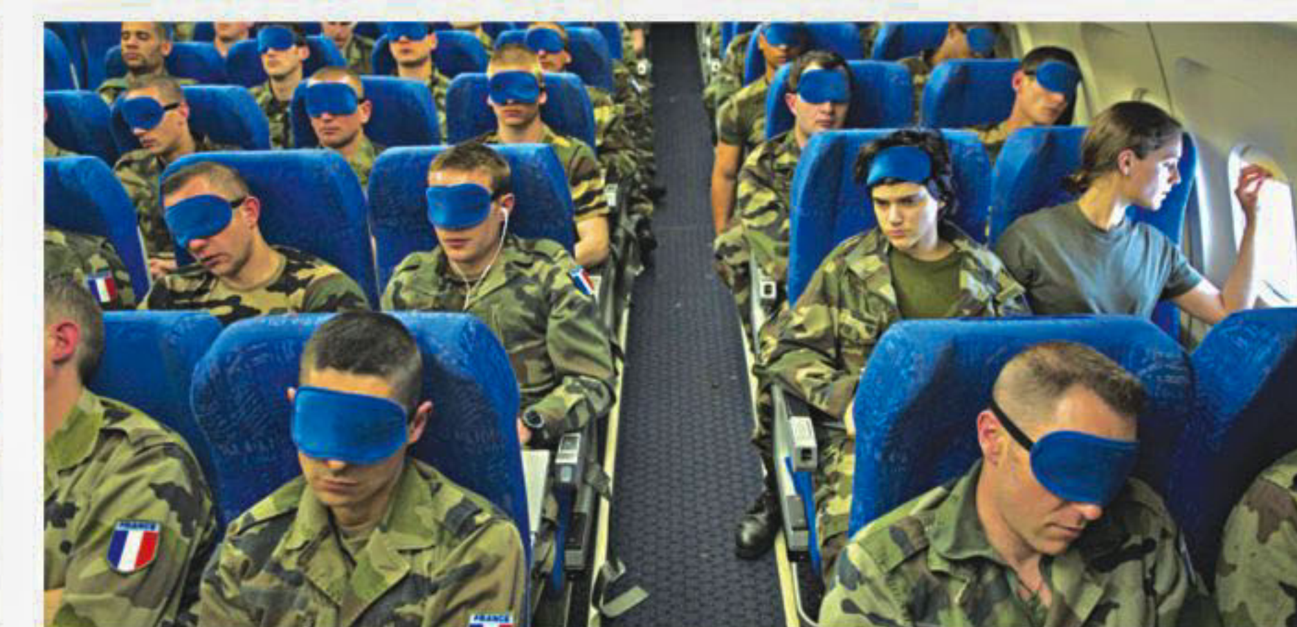
Still from The Stopover