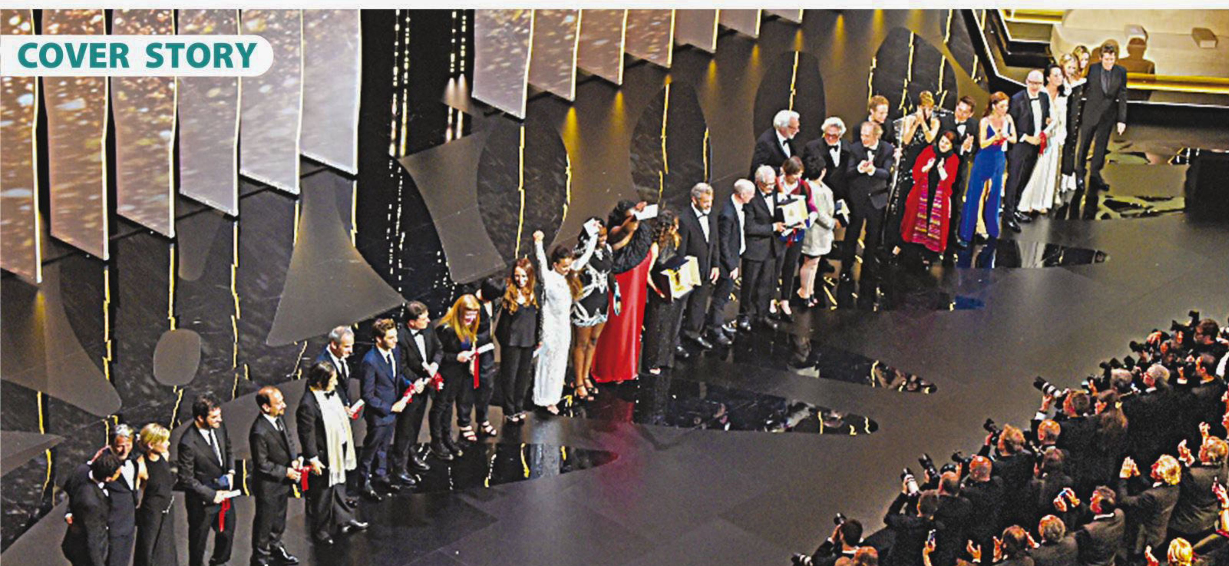
All the winners