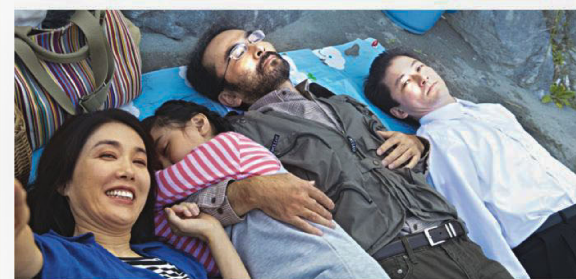
Still From Harmonium