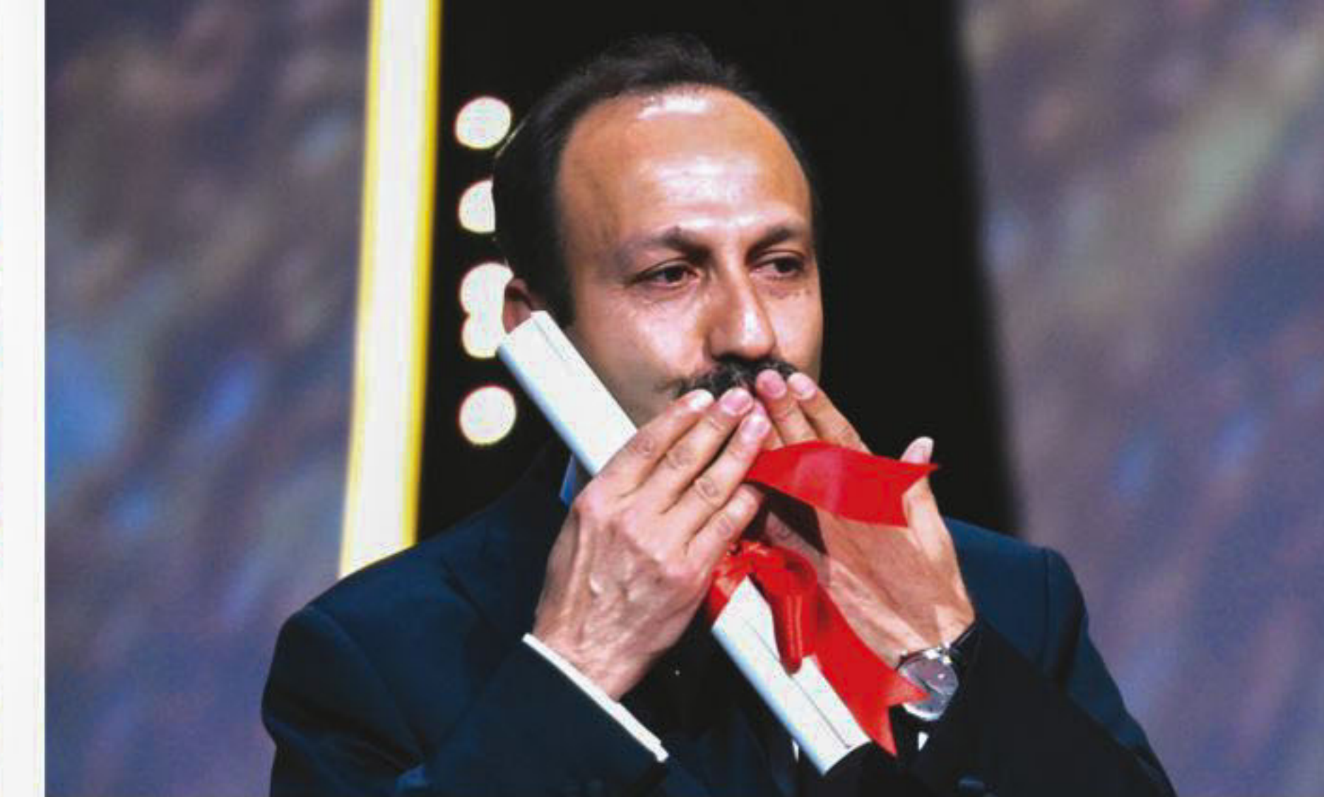
Asghar Farhadi, Winner of Best Screenplay