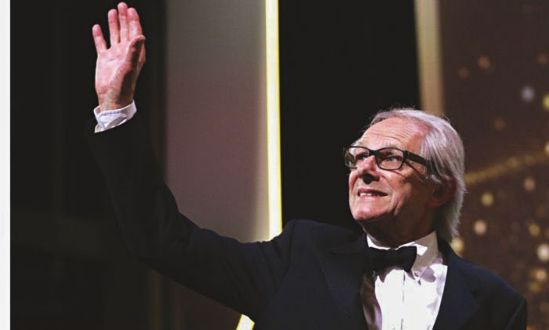
Ken Loach, Winner of Palme d'Or