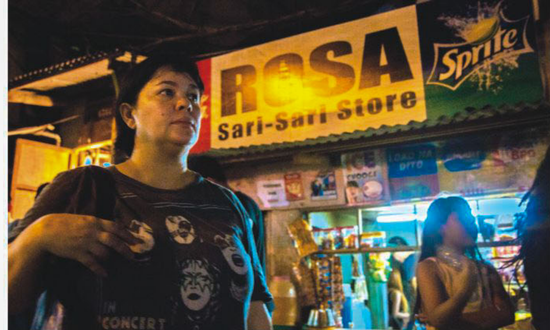
Still From Ma'Rosa