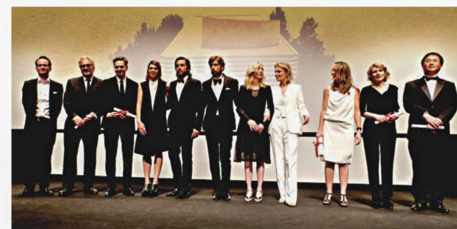
Un Certain Regard- Winners and the Jury