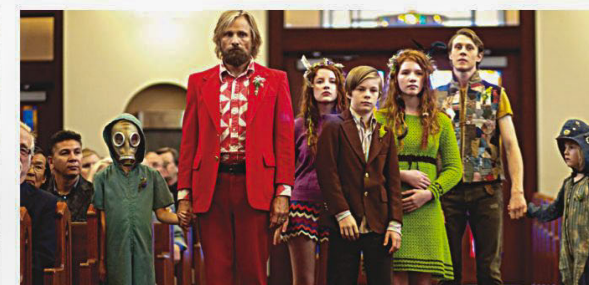
Still From Captain Fantastic