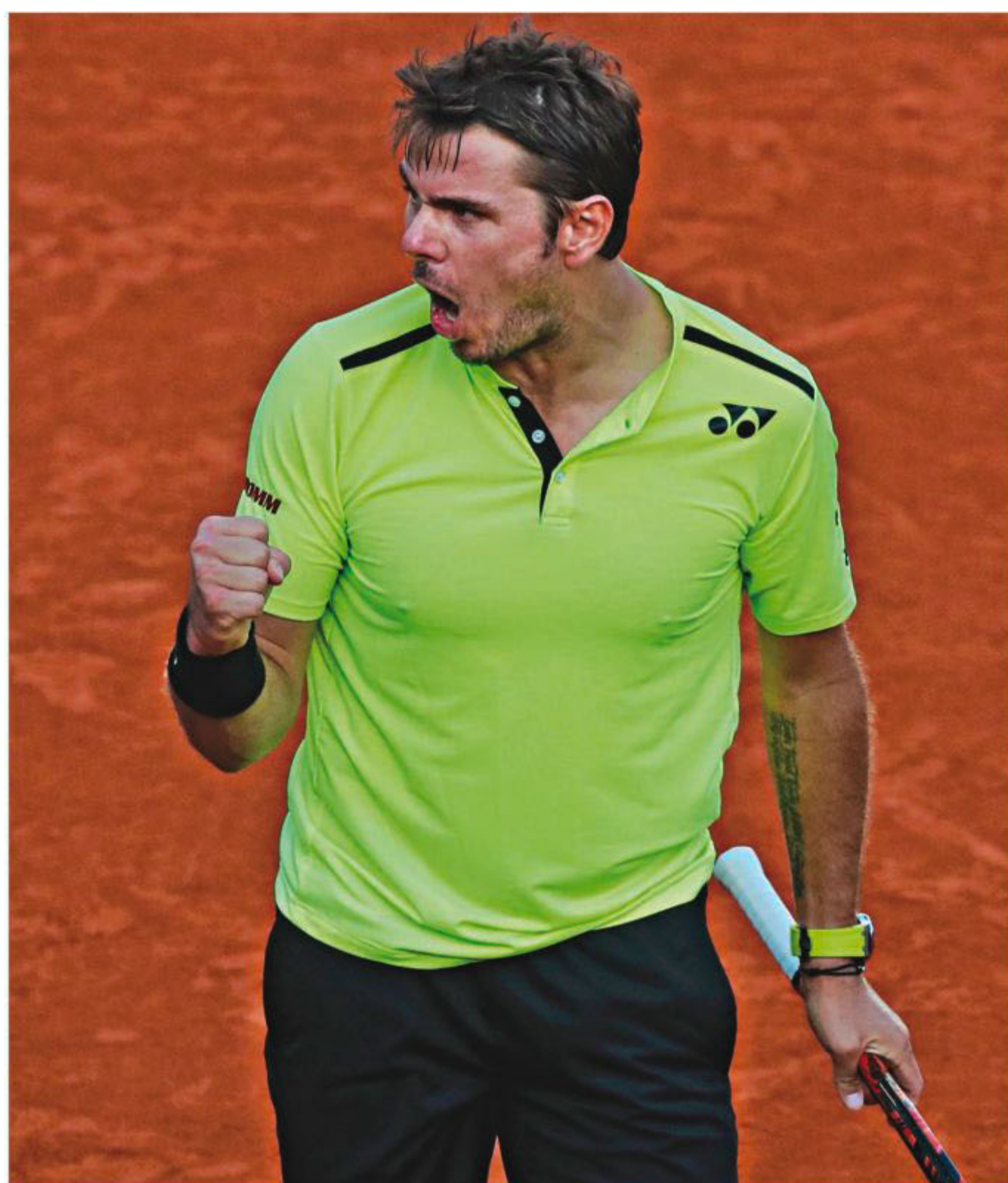
Defending champion Stanislas Wawrinka of Switzerland celebrates after his French Open third-round win over France's Jeremy Chardy at the Roland Garros in Paris yesterday