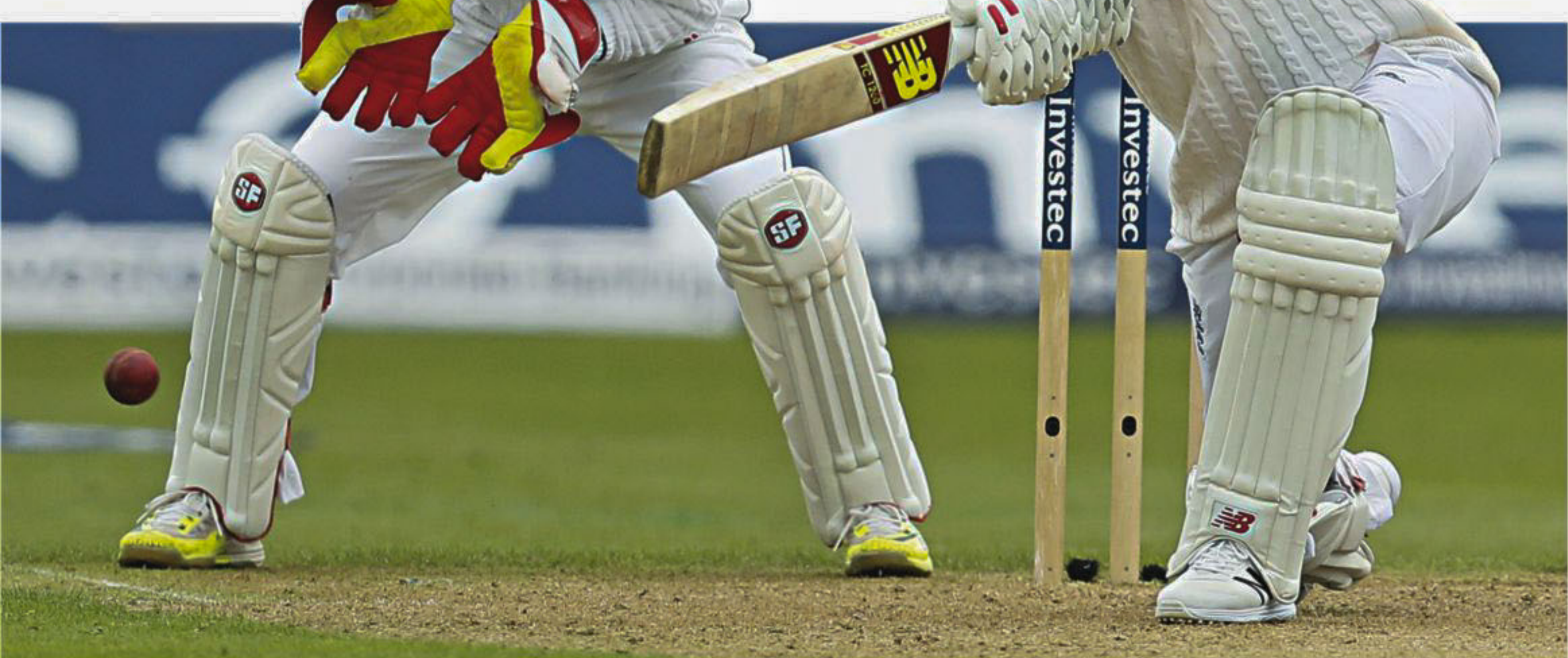
After Alex Hales and Alastair Cook were dismissed, Joe Root manned the fort for England with an innings of 80 on the first day of the second Test against Sri Lanka at the Riverside in Chester-le-Street yesterday.