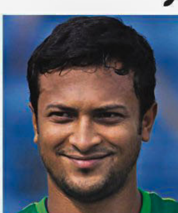
SHAKIB AL HASAN

not disappointed to miss out on the last game.