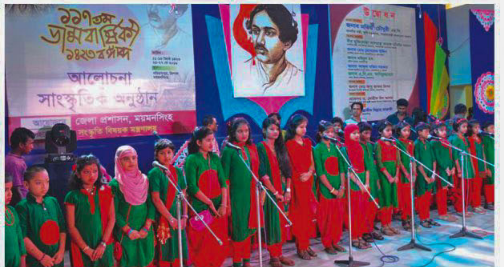
Young artistes perform at the programme.