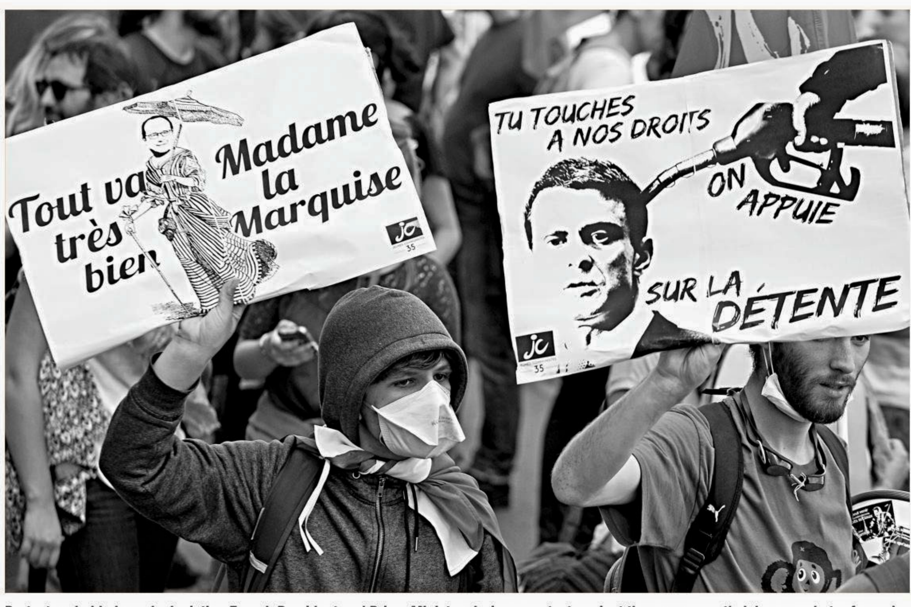
Protesters hold placards depicting French President and Prime Minister, during a protest against the government's labour market reforms in Rennes, northwestern France, yesterday. Masked youths clashed with police in Paris and striking workers blockaded refineries and nuclear power stations yesterday as an escalating wave of industrial action against labour reforms rocked France.

AFP, Kiev Two pro-Russian rebels were killed and another injured in fresh clashes with government forces in the country's war-torn east as simmering violence showed little sign of abating, separatist authorities said yesterday. The new casualties came the day after Ukraine scored a major diplomatic victory by securing the return of Ukrainian pilot Nadiya Savchenko as part of a prisoner swap with the Kremlin.