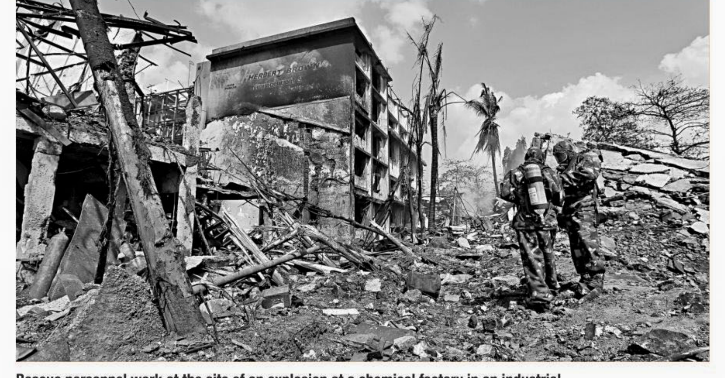
Rescue personnel work at the site of an explosion at a chemical factory in an industrial area in Dombivli, on the outskirts of Mumbai, India, yesterday. The explosion tore through the chemical plant, killing three workers and injuring up to 35 others, officials said.

AFP, Gaza City The Israeli air force carried out strikes on Hamas sites in Gaza early yesterday in response to a rocket attack targeting the Jewish state, the army and Palestinian officials said. The rocket, which hit an open area in southern Israel, caused no damage or casualties. In response, the Israeli air force "targeted two Hamas sites in the southern Gaza Strip," the military said in a statement. A statement from Ajnad Beit al-Maqdis, a small Salafist jihadi group, claimed the rocket attack, which came hours after Israeli Prime Minister Benjamin Netanyahu sealed a deal to bring headline nationalist Avigdor Lieberman into his coalition as defence minister. "We announce our responsibility for targeting the Nahal Oz military base with a missile," it said. According to the army, nine projectiles fired from the Gaza Strip -- which is run by Islamist movement Hamas -- have hit Israel since the start of 2016. Smaller, more radical Islamist groups have often been blamed, with Hamas forces either unwilling or unable to prevent the rocket fire.