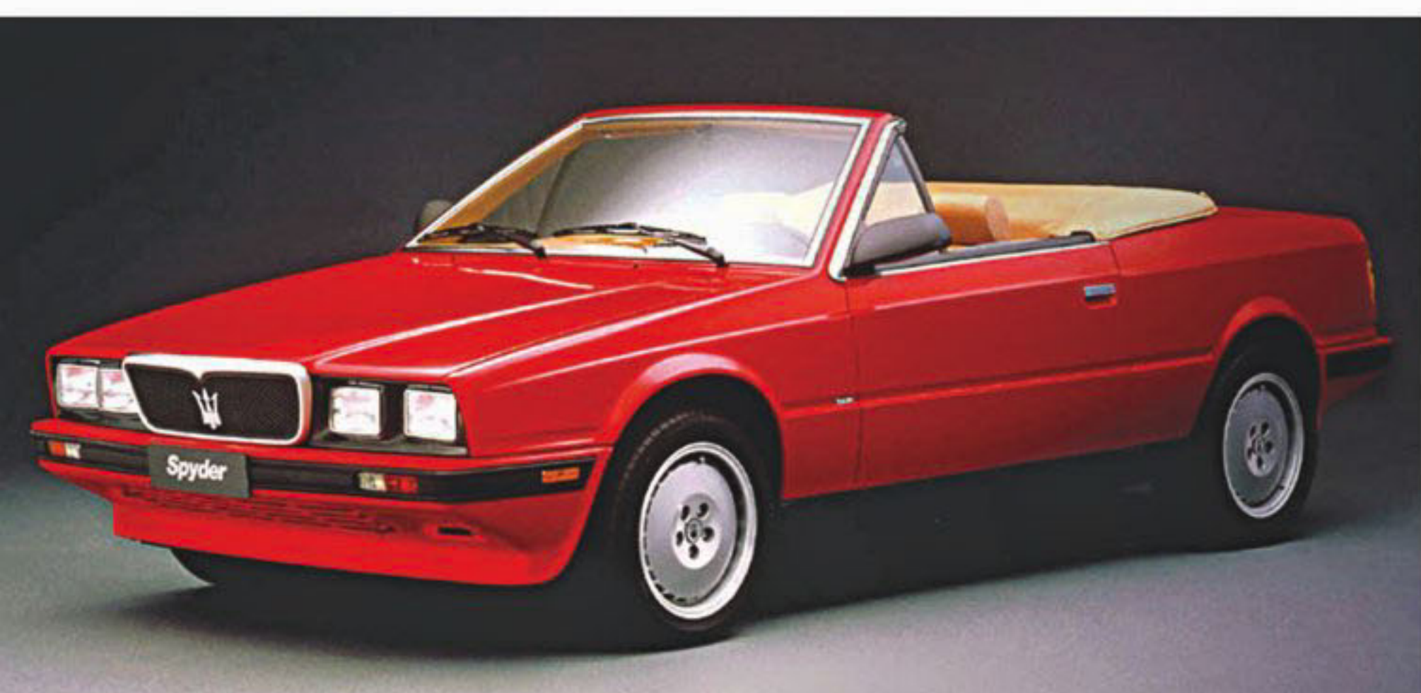
No one did 80's boxy cool like Zagato - the 1984 Maserati Bi-turbo spider improved on the coupe by chopping the roof and adding subtle design cues here and there.

The first Alfa worked on by Zagato was the 6C, in 1929. It wasn't till the early 60's that Zagato created a stir in the automotive world - the 1963 Giulia TZ1 was a purpose built racecar that won its class at Le Mans. The 1989 SZ (left) is a cult classic, fetching very high prices at auctions, despite what many call "opinion dividing" design. The Alfa-Zagato partnership has yielded 14 unique coachbuilt models, all with Alfa's signature driving dynamics and Italian engineering coupled with Zagato's design and craftsmanship.