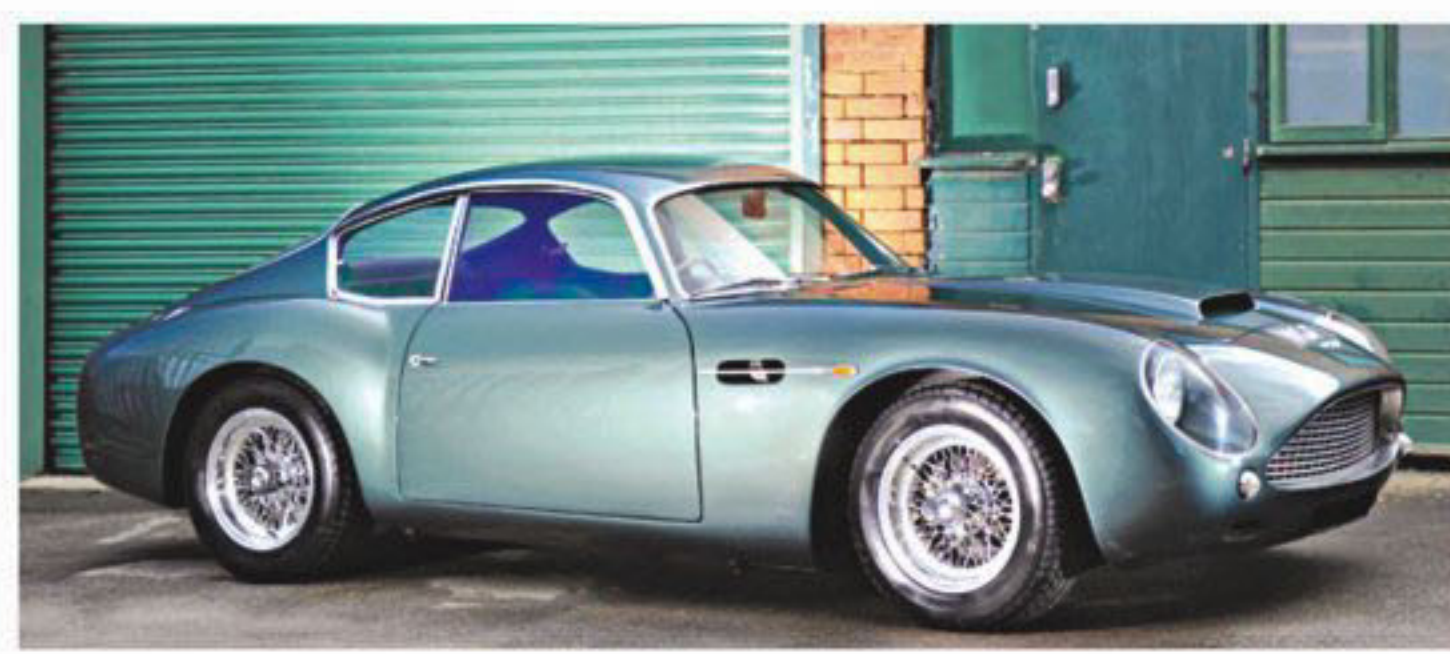
It's difficult to get over how good looking the DB4 Zagato is. The cool successor, the 2010 V12 Zagato (right), can only hope to live up to it.