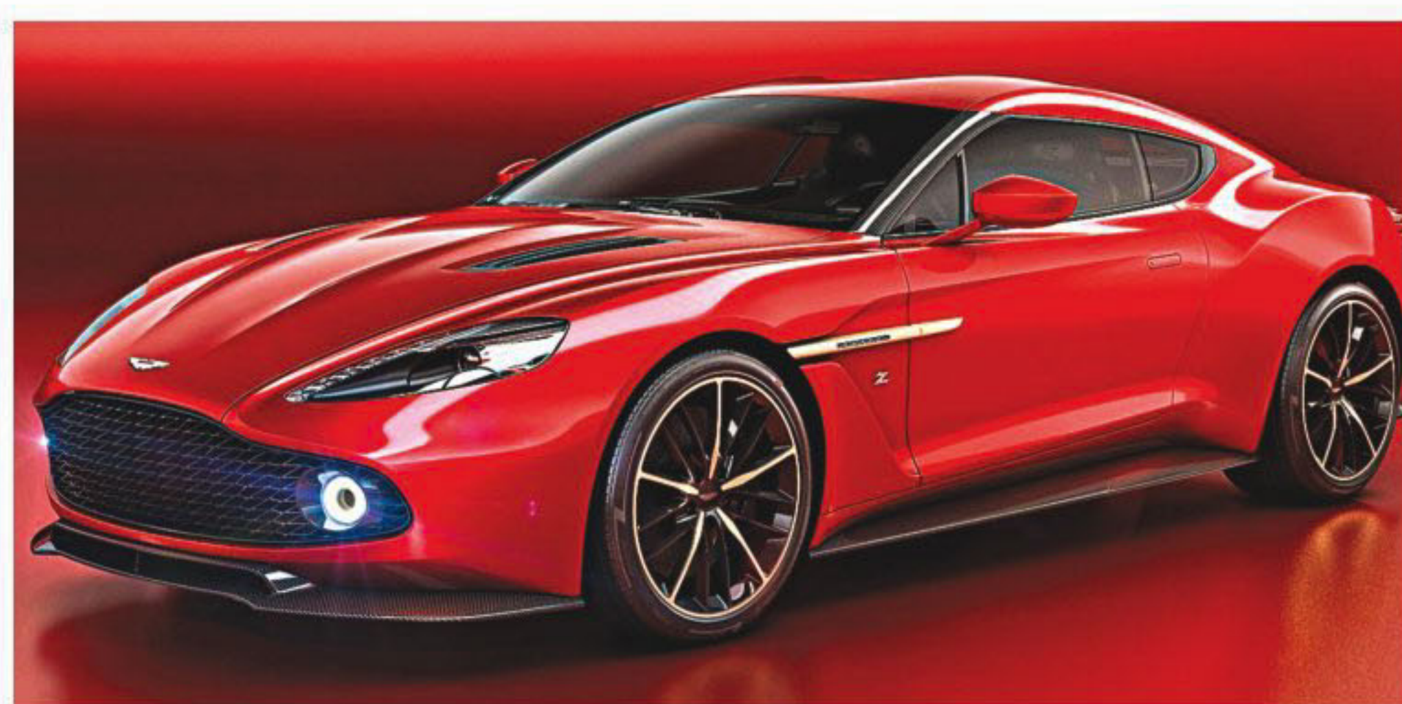
The all new Vanquish Zagato, launched last week, comes with signature Zagato styling cues: double bubble roof, sharply cut rear with round taillights, and aerodynamic slashes in the profile.

Zagato hasn't built too many models for the bigger Italian names, but the one or two they made were instant classics. The Maserati Bi-turbo (above) was hated initially for being a box, but it's considered one of the coolest of the 80's whacky supercars. The most notable Ferrari worked on by Zagato has to be the 575 GTZ (left), which turned heads like no other.