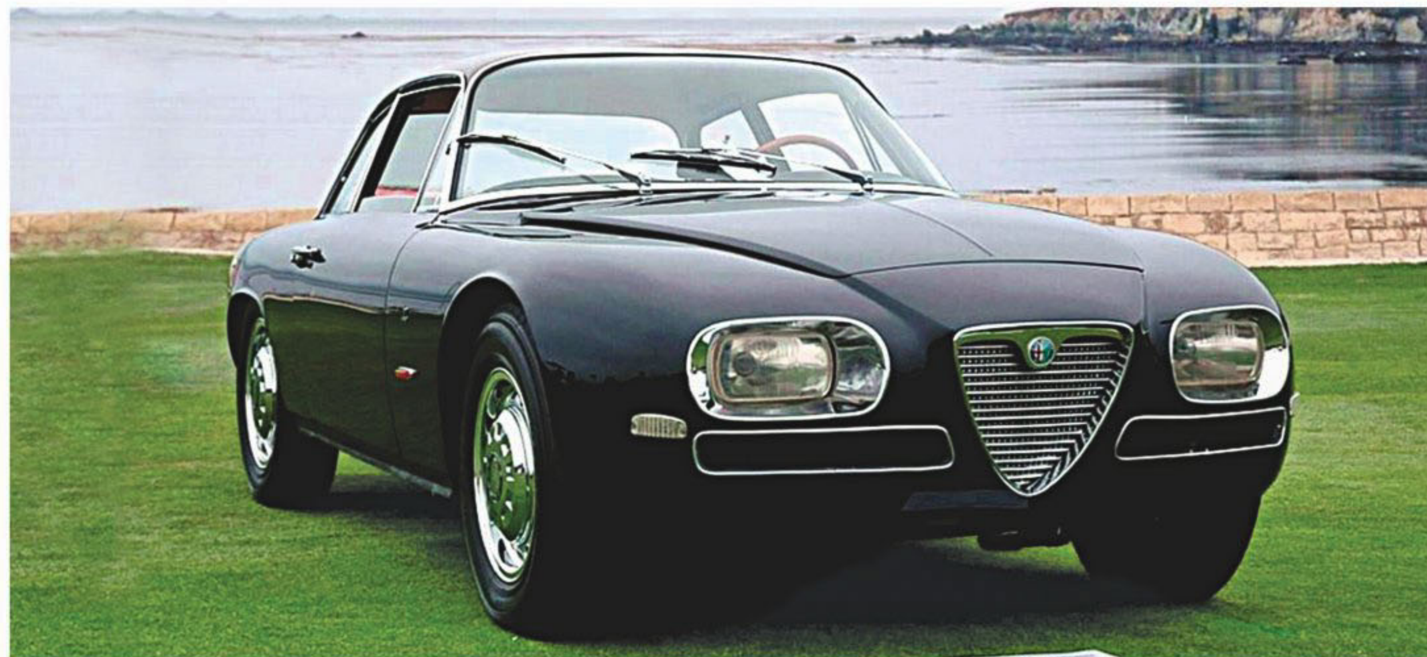
One of the rarest Alfa models of all time (only 105 were made), the 2600 Sprint Zagato was an opulent, powerful machine coachbuilt for enthusiasts and collectors.