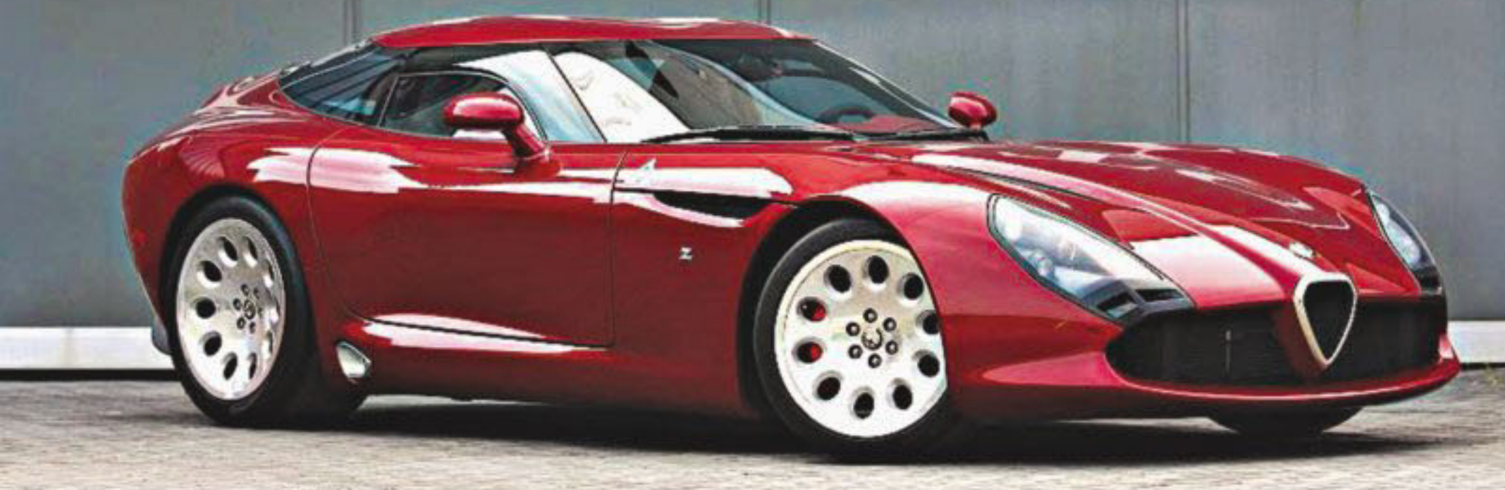
The TZ3 continues Zagato's long-lived partnership between Alfa Romeo and Zagato.