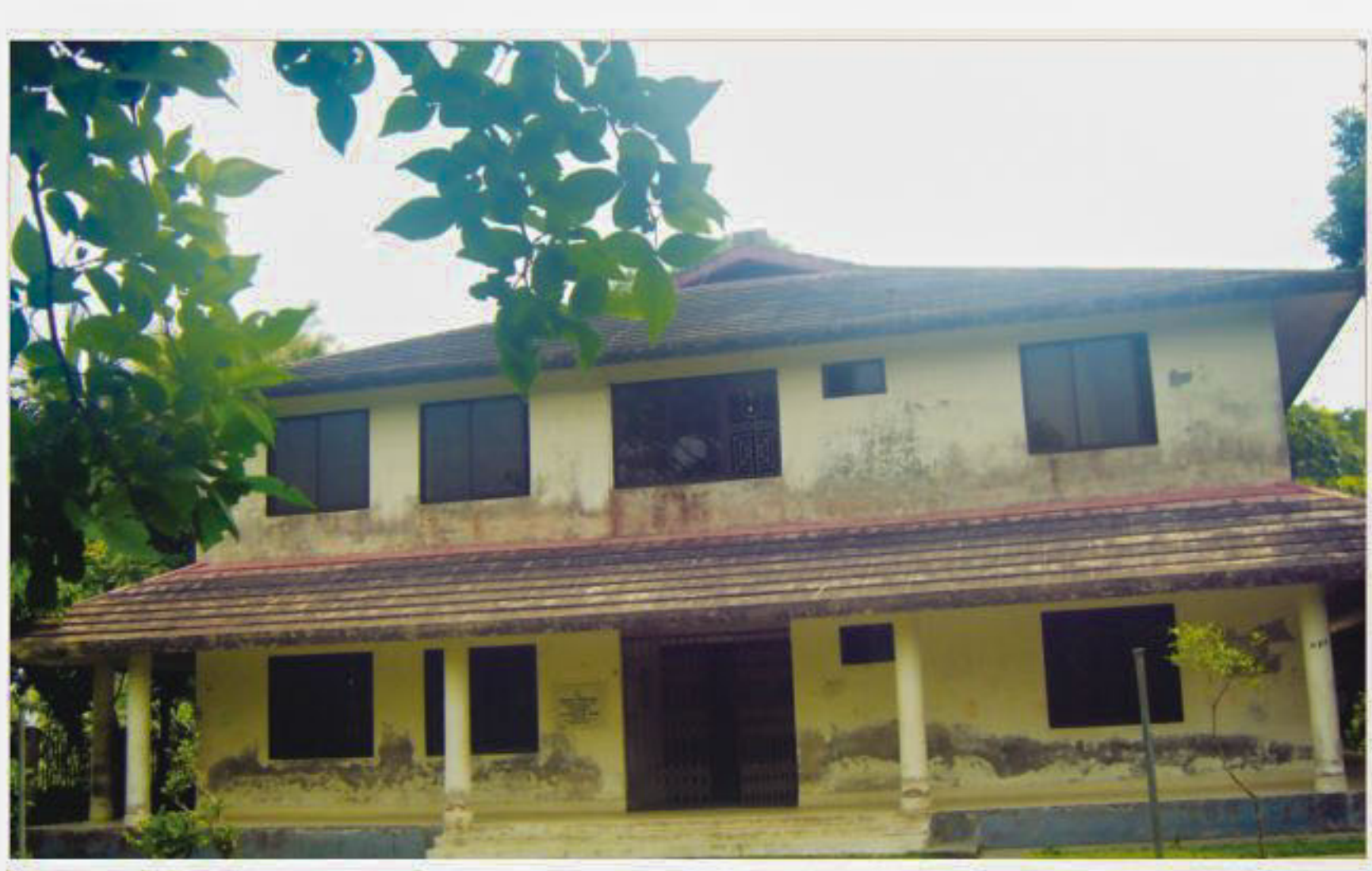
Nazrul Memorial Centre in a derelict condition.