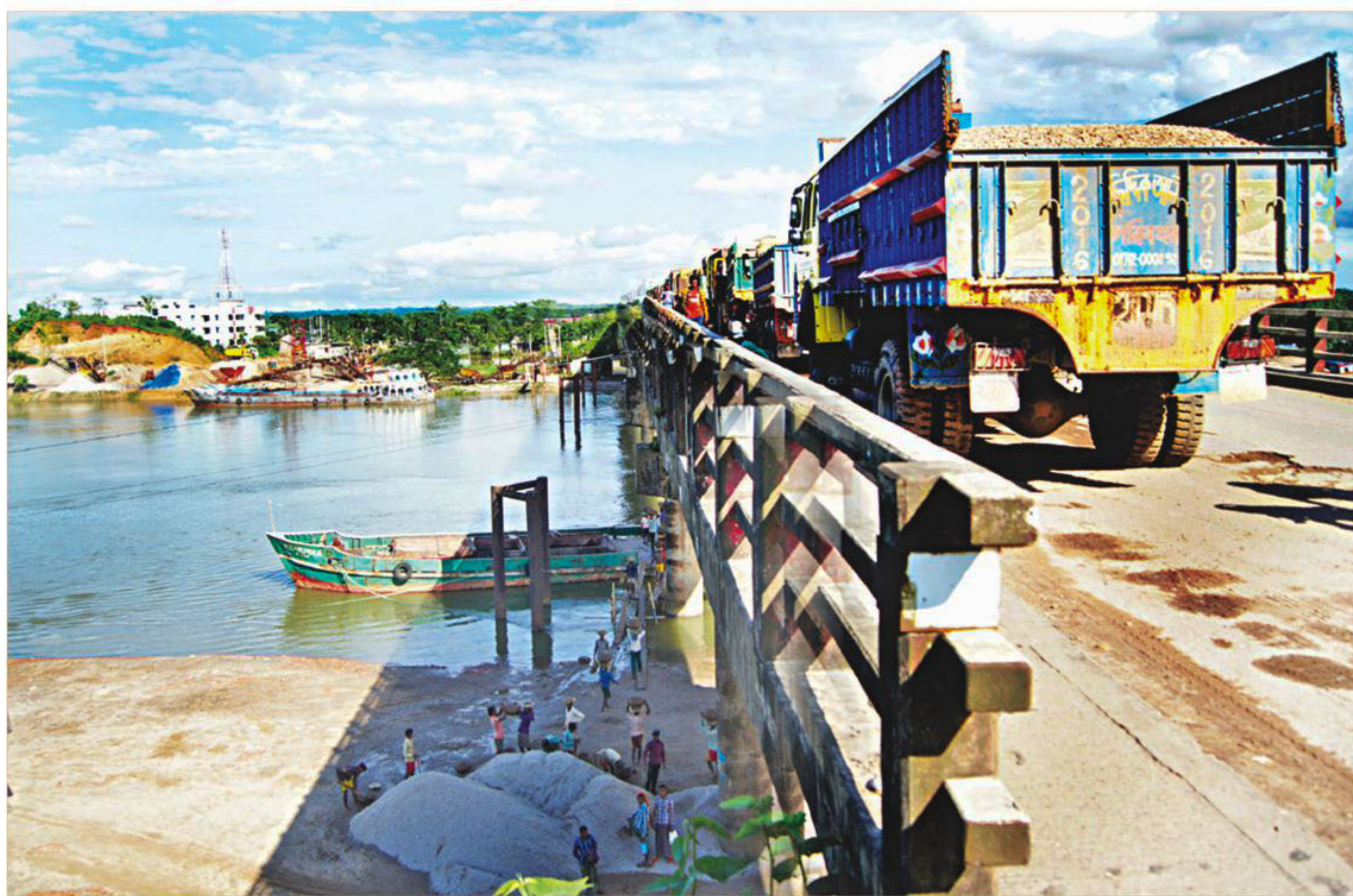
The Shalutikor bridge over Chenger Khal River in Sylhet is under a severe threat due to the volume and the frequency of the trucks loaded with sands and stones which far exceeds its capacity. On top of that, ships are often anchored using the pillars of the bridge for loading. The photo was taken on Monday afternoon.