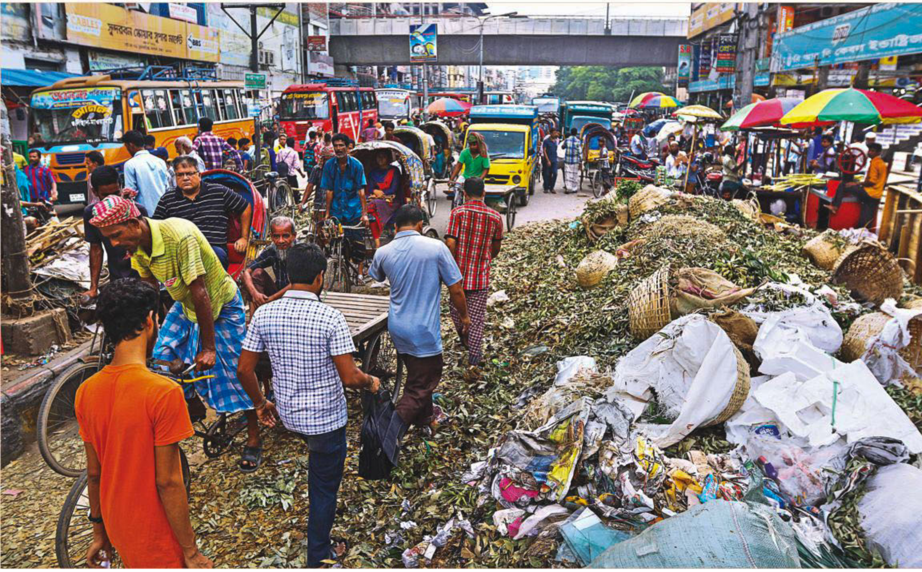
Pedestrians painstakingly make their way through garbage and rows of vehicles on the capital's Nawabpur Road, almost the entire one side of which is taken over by garbage, thrown by vendors who are illegally occupying the adjacent footpath, and even a portion of the road too. The photo was taken in front of Kaptan Bazar Complex yesterday.

It said information about the marine flora would help best utilise resources and accelerate sustainable blue economic growth.