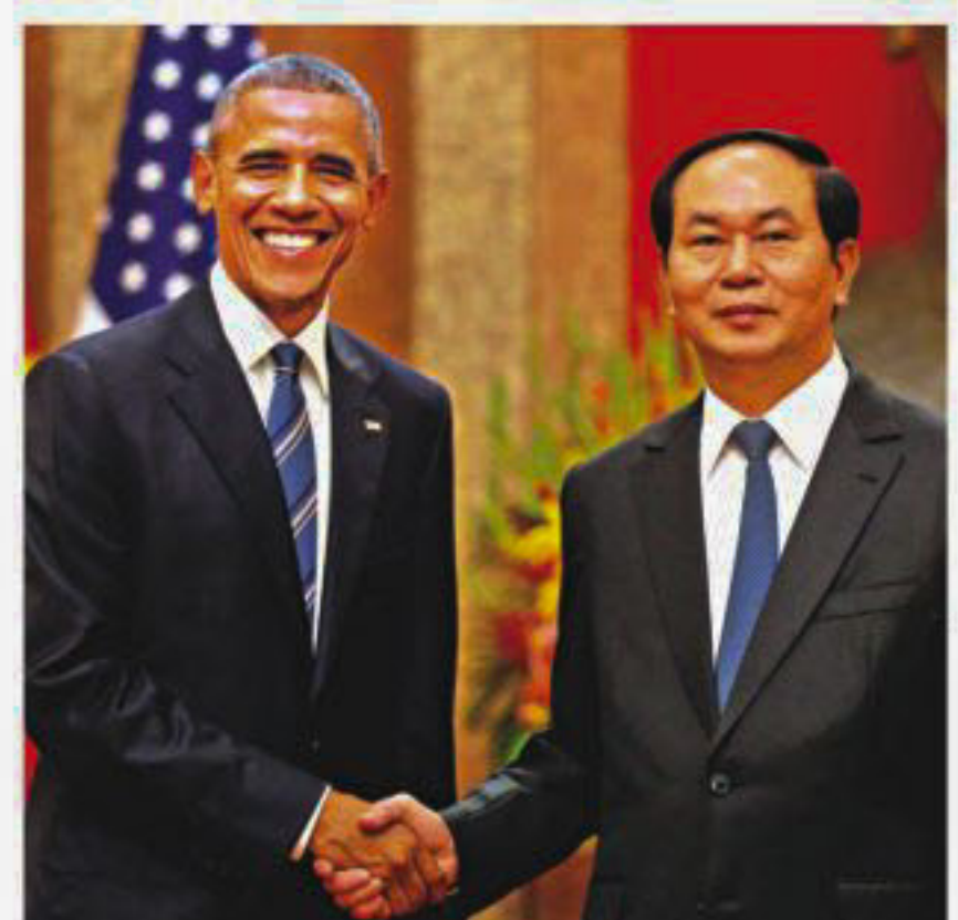
US President Barack Obama shakes hands with Vietnamese President Tran Dai Quang in Hanoi yesterday.

US President Barack Obama yesterday scrapped a Cold War-era ban on weapons sales to Vietnam, as ties between the former foes grow closer thanks to trade and mutual fears of Chinese expansion in disputed seas. The announcement, made at the start of Obama's three-day visit to Vietnam, could strengthen Hanoi's hand against Beijing, which has been increasingly assertive in its claims to contested areas of the South China Sea. "Over the past century, our two nations have known cooperation and then conflict, painful separation, and a long reconciliation," Obama said at a press conference alongside Vietnam's President Tran Dai Quang. The move, Obama added, was not prompted by China's regional manoeuvres but came as the countries entered a "new moment" taking them towards a "normalisation" of ties. Quang welcomed the rollback of the ban, hailing the shared "common concerns and interests" that now bind the two countries. The Obama administration has pitched this week's trip as an opportunity to push ties beyond the period of rapprochement, with Vietnam a vital plank in America's much vaunted pivot to the Asia-Pacific. The visit is Obama's first to the country -- and the third by a sitting president since the end of the Vietnam War in 1975. Direct US involvement in SEE PAGE 10 COL 1