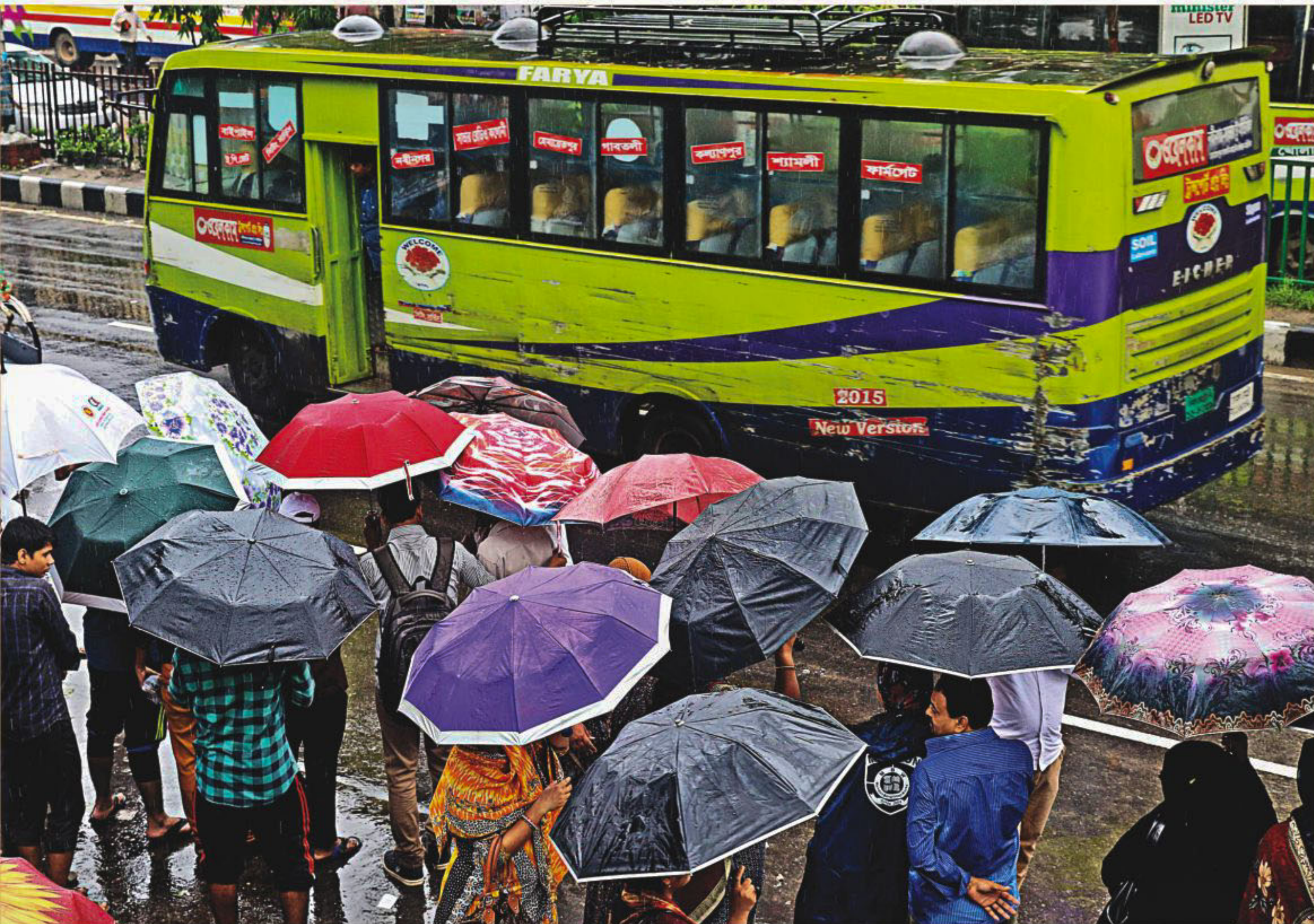
People wait for buses at Farmgate junction in the capital amid the pouring rain caused by Cyclone Roanu in the Bay. Roanu made landfall yesterday afternoon causing damage and fatalities in the coastal areas.