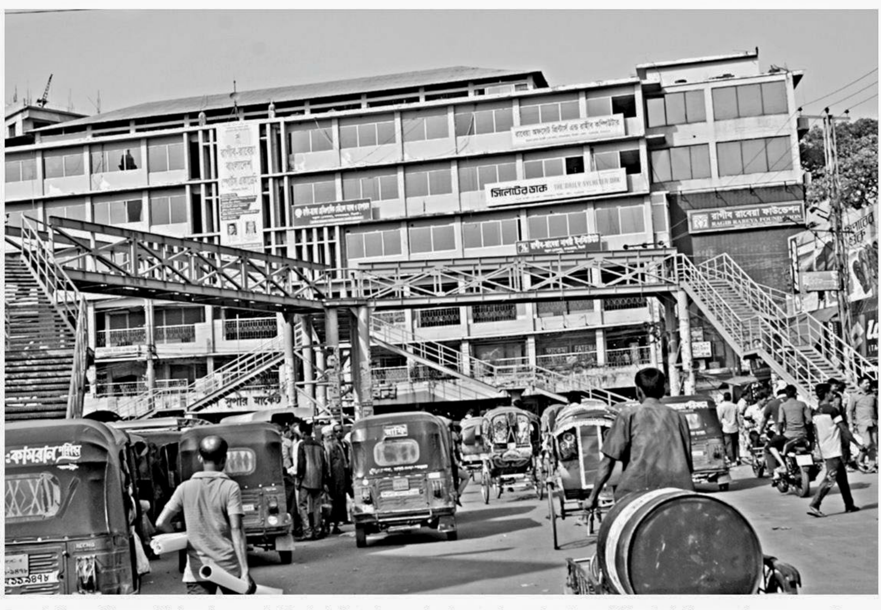
Even during rush hours this lone foot-overbridge in Sylhet city remains deserted as pedestrians, risking their lives, continue to cross the busy street due to a lack of initiative from the authorities concerned for creating awareness. The photo was taken last week in the Court Point area.