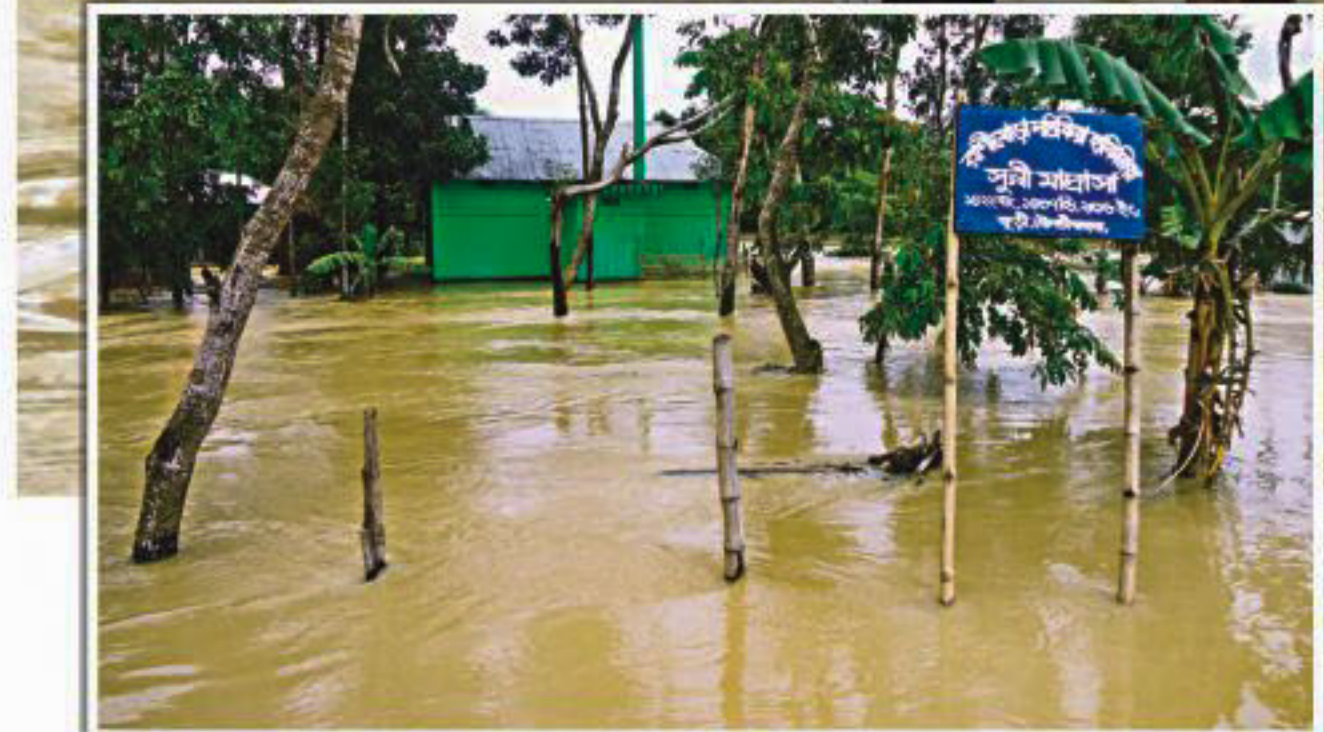
People try to move their belongings to higher grounds as the rising water level of the Juri river in Moulvibazar worsens the flood situation yesterday. Inset, a madrasa flooded by the onrush of water in Juri upazila.

OUR CORRESPONDENT, Moulvibazar Flood situation in the district's Juri upazila has worsened due to incessant rain and onrush of water from the hills for the last couple of days. Water of the Juri river was flowing above the danger level yesterday. Most affected unions are Joyfornagar, Sagornal, Pachim Juri, Gualbari and Phultola. Locals are moving to safer places. Road communications between Juri upazila town and the five unions have remained snapped as many roads and bridges went under water. Production at Ratna and Kapnapahar tea estates was shut down on Thursday as the tea gardens were flooded. Moriom Begum, 45, of Phultola village under Phultola union, said their family took shelter in a safer place, fearing that something bad might happen. Husna Akther, 32, of Ranimura village in Sagornal, said she and her other family members found shelter in her parents' house in Krishnanagar village in the same upazila. Fish of over 100 ponds was washed away. Relief materials were sought from the government for the affected people, said Emdadul Islam Chowdhury, chairman of Sagornal union. Foyaz Ali, chairman of Phultola union, said 11 houses in Gouripur village were washed away by flood water yesterday morning. Kishore Roy Chowdhury Moni, Juri upazila vice-chairman, said at least 20 government primary schools were submerged. Over 5,000 families of the flood-affected upazila were suffering from acute shortage of drinking water, he added. SEE PAGE 11 COL 4