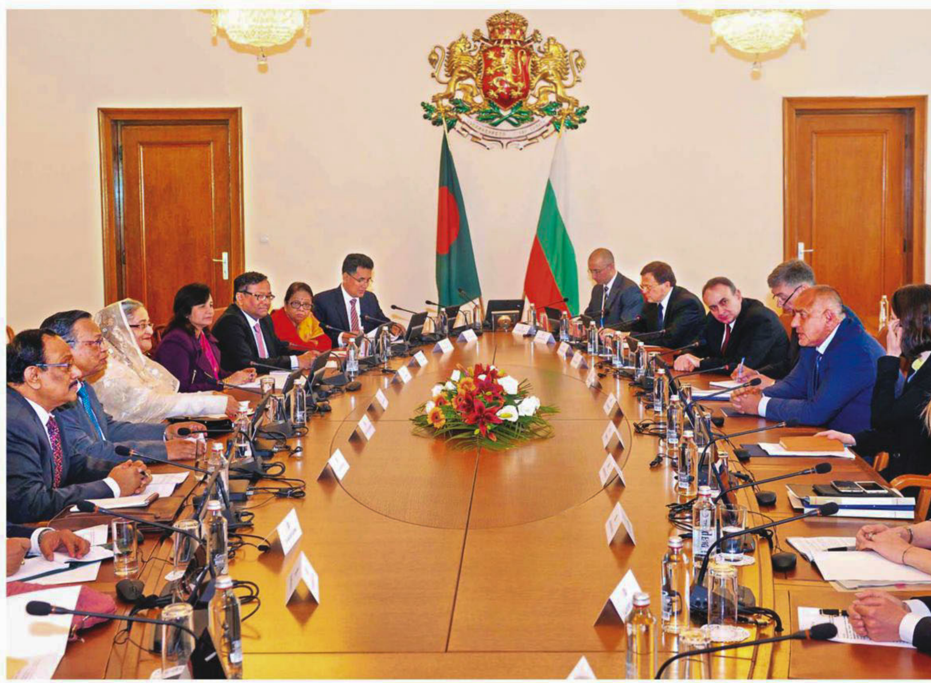
Flanked by high officials, Prime Minister Sheikh Hasina has official talks with Bulgarian Prime Minister Boyko Borissov, sitting across her, and his delegation at the Council of Ministers' Plenary in Sofia yesterday.