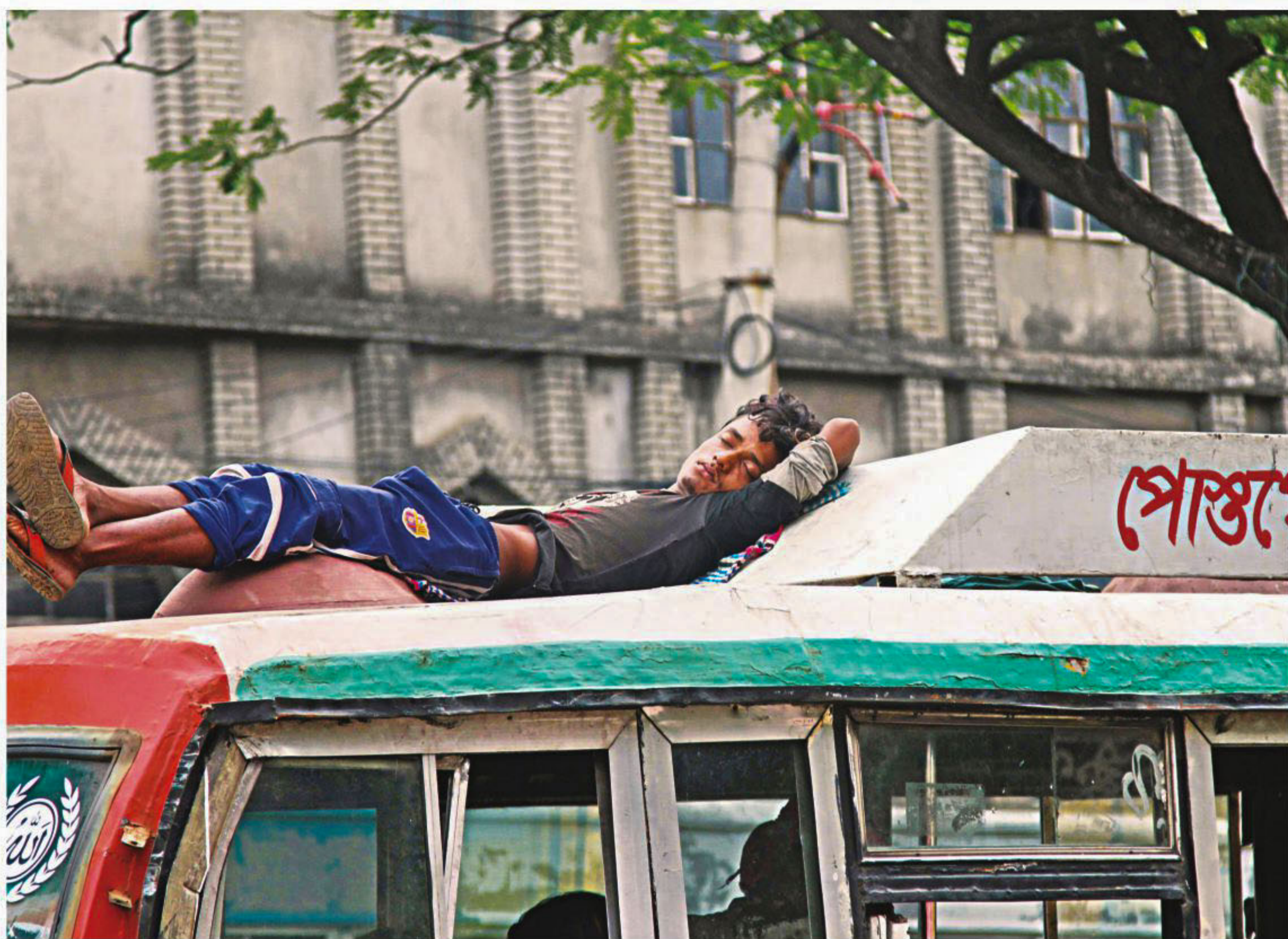
With no protection whatsoever, a man dozes off on the roof of a running bus, oblivious to the risk of falling off the roof anytime. He may meet a terrible tragedy if the bus slams on the brakes suddenly. The photo was taken in the capital's Bashabo area on Tuesday.