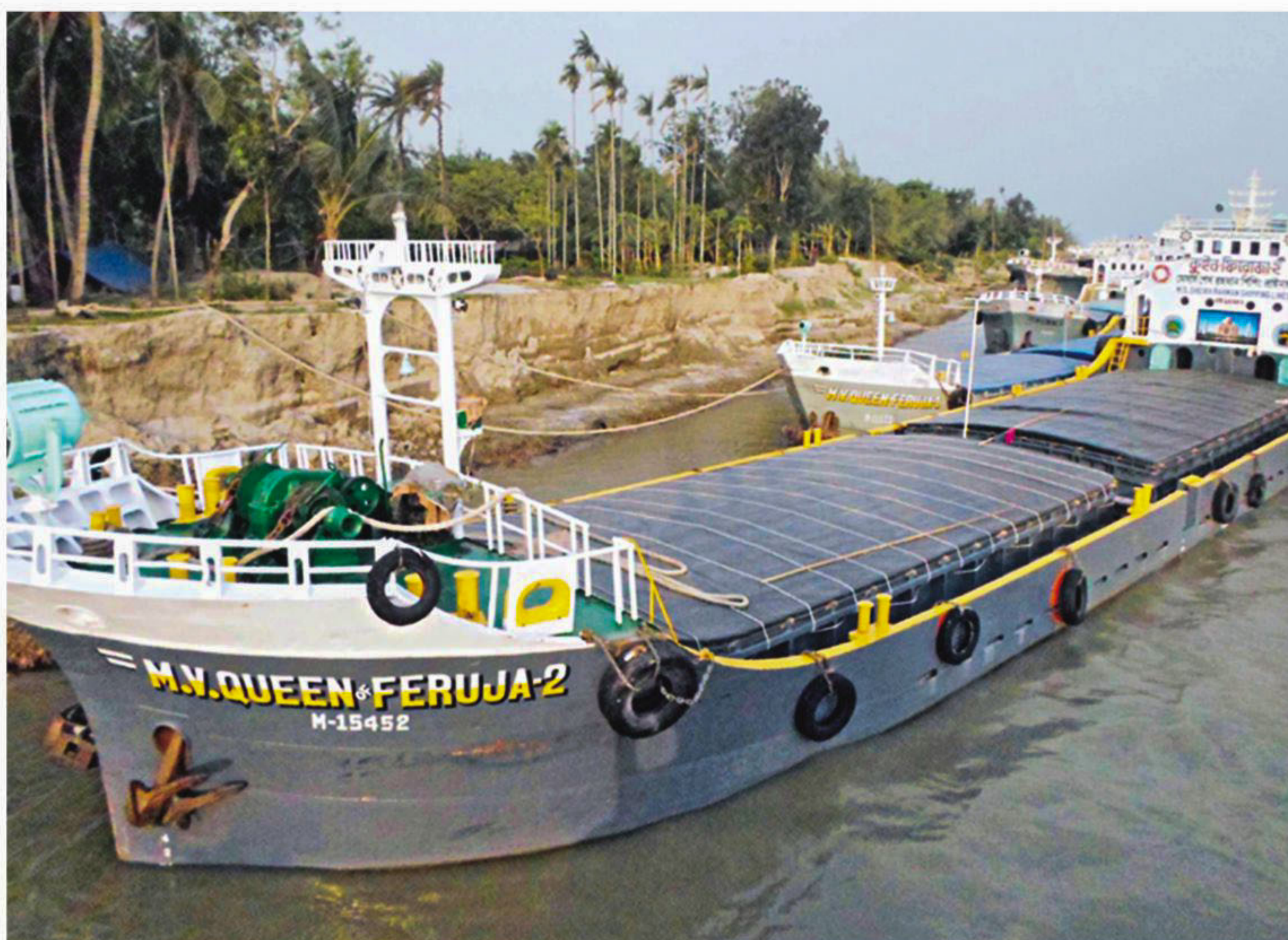
Cargo vessels carrying fuel, coal and fertilisers lie stranded near Paturia and Daulatdia ferry ghats for the last couple of days due to poor navigability in the Jamuna river. The vessels are supposed to go to the northern districts. The photo was taken on Tuesday.