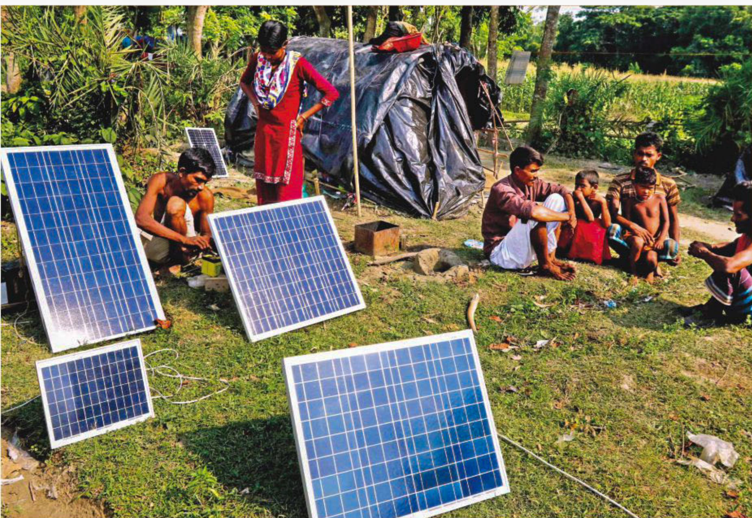
A man is working on a solar panel at a Bede Palli on Dhaka-Aricha highway in Manikganj. Use of solar panels to generate electricity has become popular among the Bedes, a gypsy community people, as it does not require any additional fuel cost. The photo was taken recently.