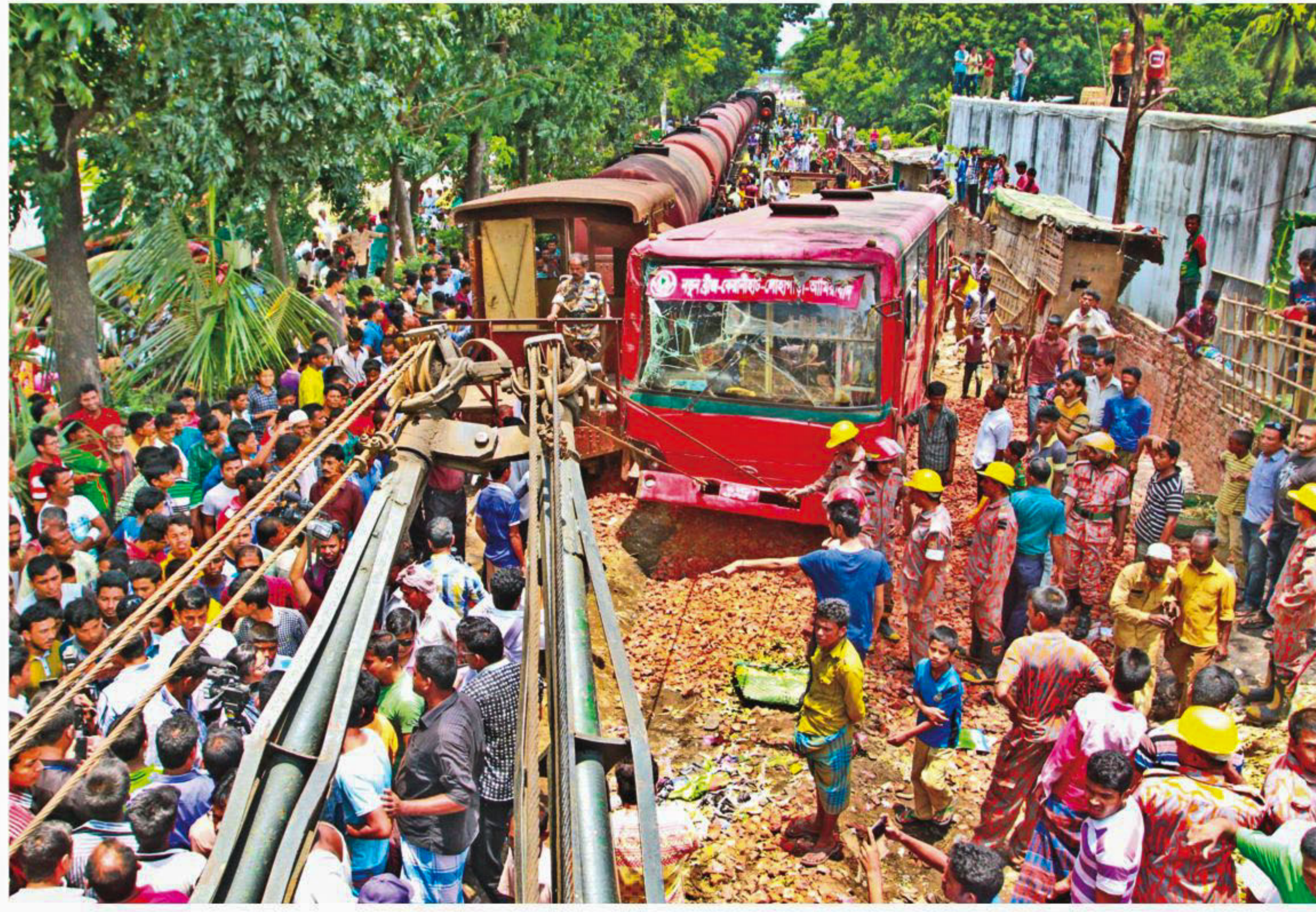
A tow truck pulling a damaged BRTC bus after it was hit by an oil tanker train at a level crossing in Chittagong's Sholoshohor area yesterday. Two women were killed and at least five others injured in the incident.