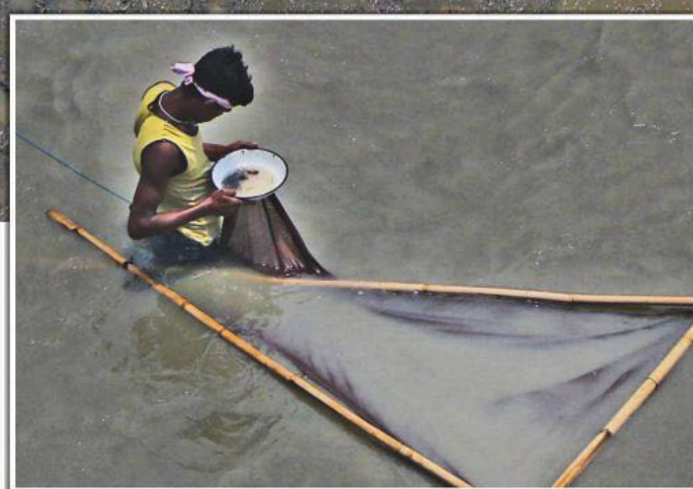
Defying a ban on fishing in the Karnaphuli river during high tide, fishermen are catching shrimp fry. A fisherman, inset, takes a look at his catch. Such illegal fishing is destroying the juvenile fish and depleting their overall stock. The photos were taken from Shah Amanat Bridge in Chittagong a few days ago.