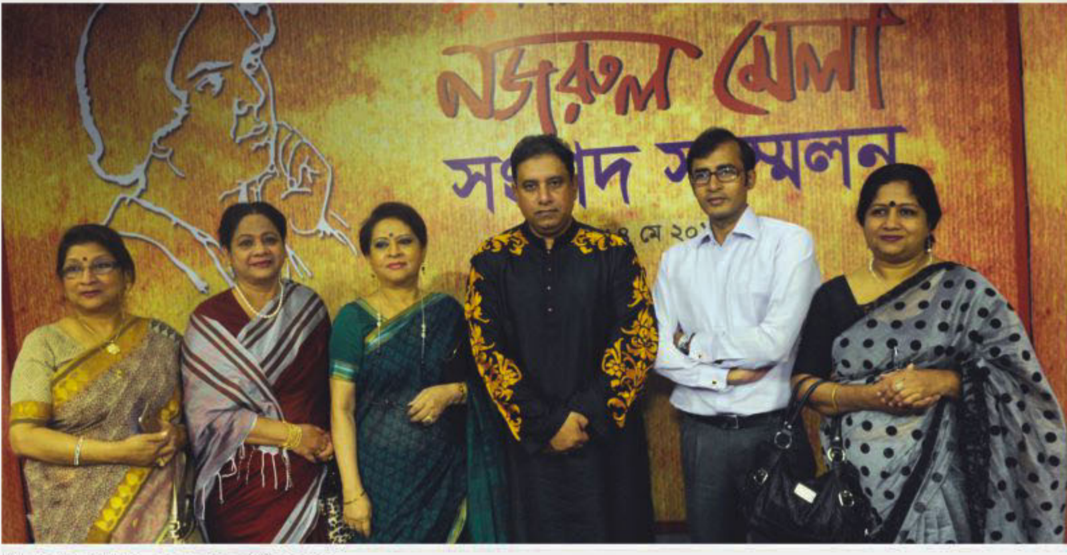
Guests at the press conference.