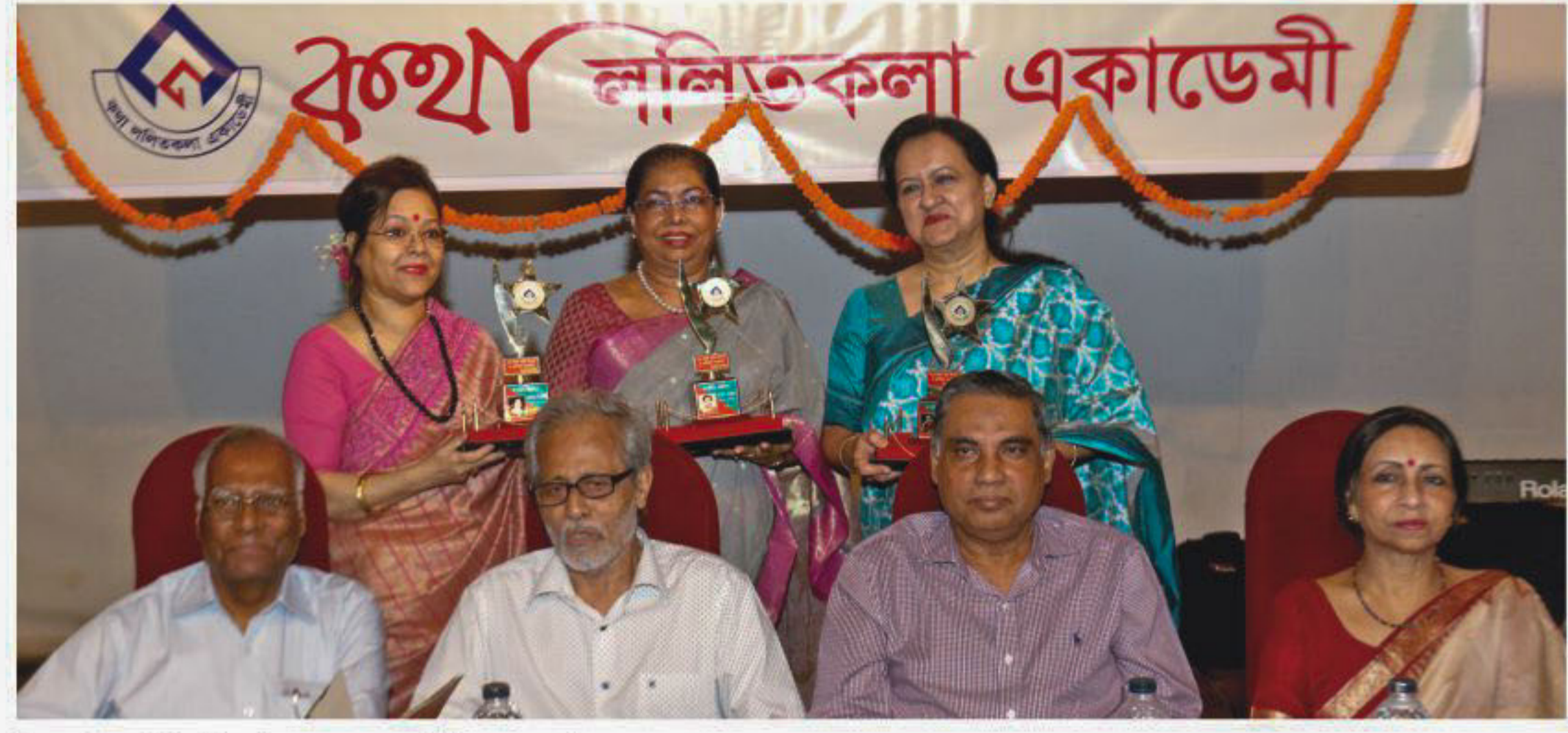
Guests with the honorees at the event.