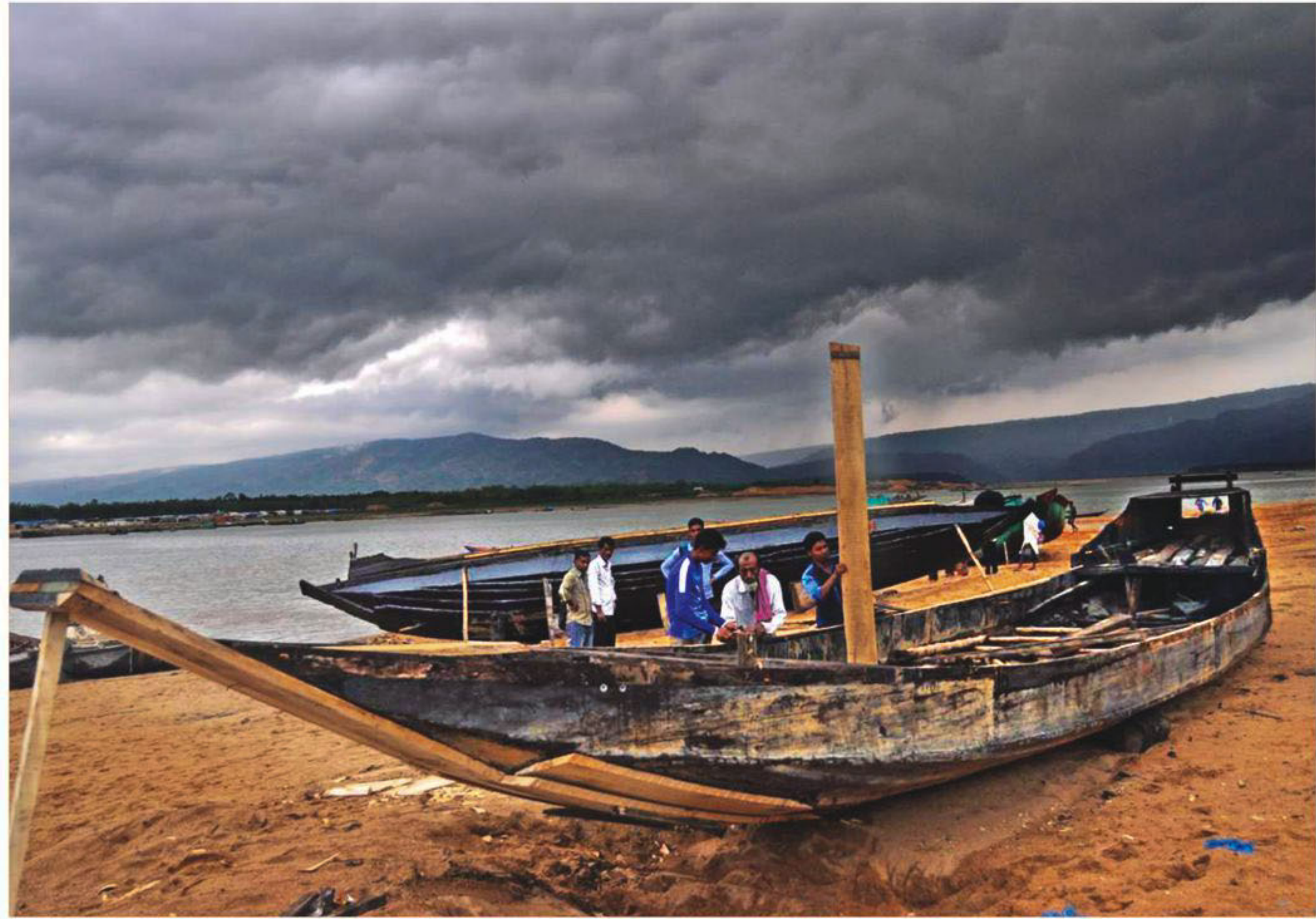
With thick and dark clouds over their heads, boat makers work on a vessel on the bank of Jadukata river near Binnakali Bazar in Tahirpur upazila of Sunamganj. Boat makers are passing busy days ahead of the rainy season when people's lives in such haor areas are unimaginable without this watercraft. The photo was taken recently.

BB officials were unskilled, negligent and careless about the issue