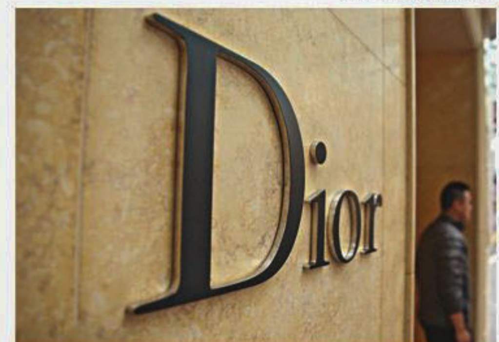
She spent $220,200 at the Christian Dior Sydney store in one day. She spent $94,520 the next day.