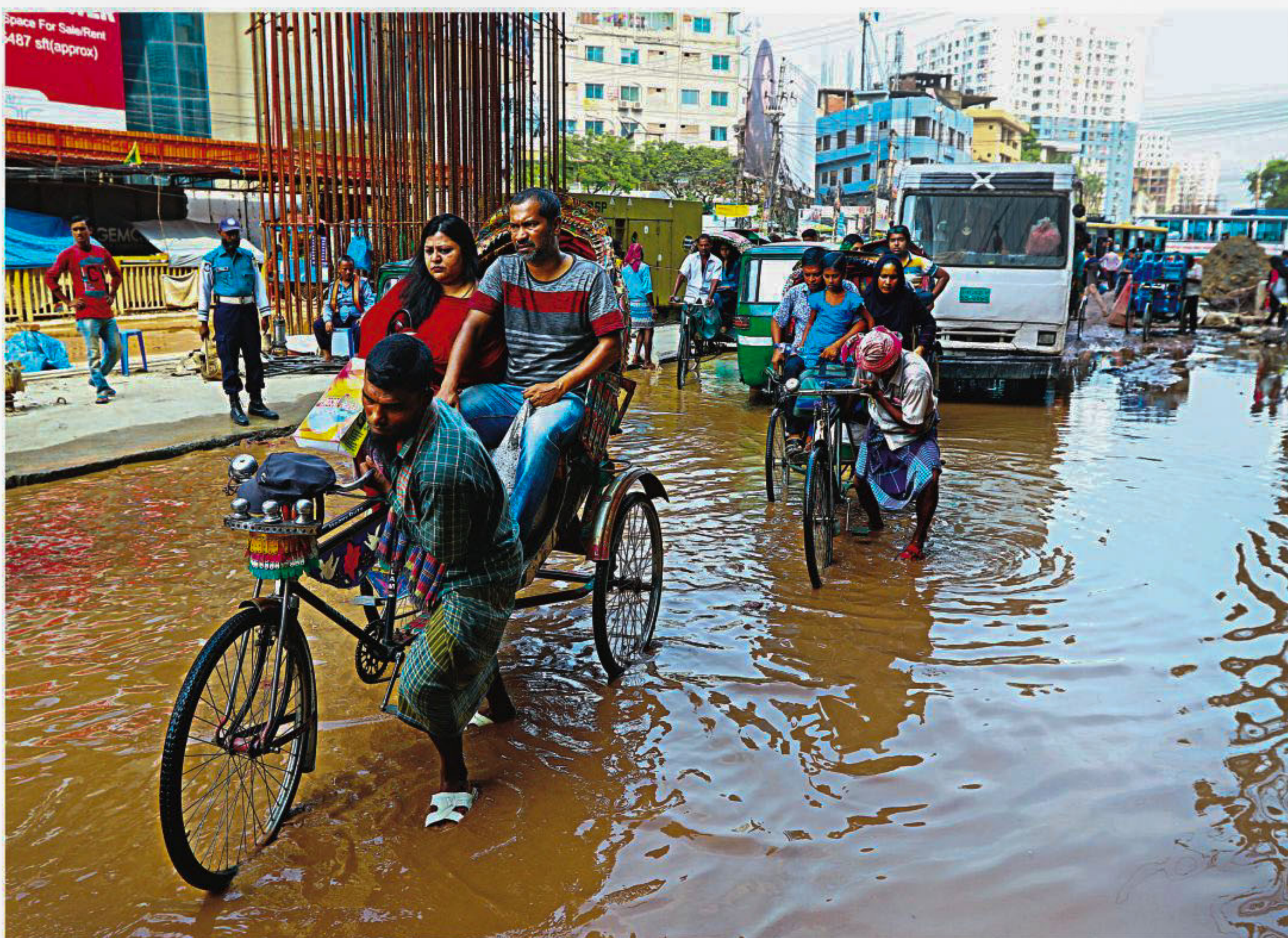
Rain and the construction work on the Mouchak-Malibagh flyover have left the Outer Circular Road in the capital almost unusable. The photo of people having to travel dangerously on the road was taken yesterday at Malibagh intersection.