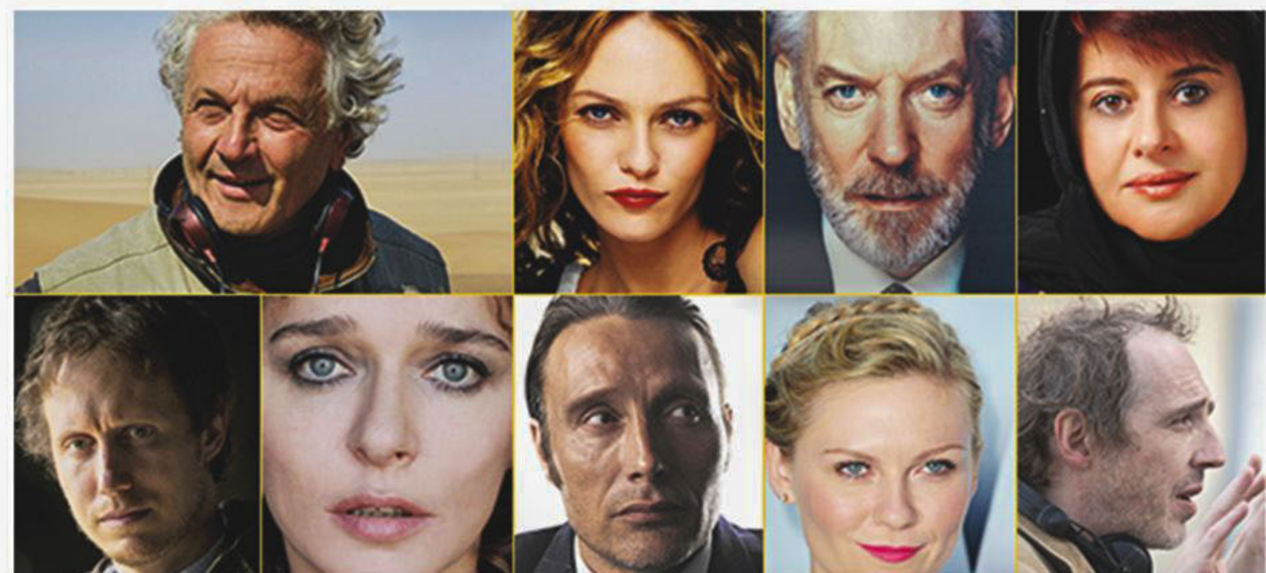
Jury for the Main Competition