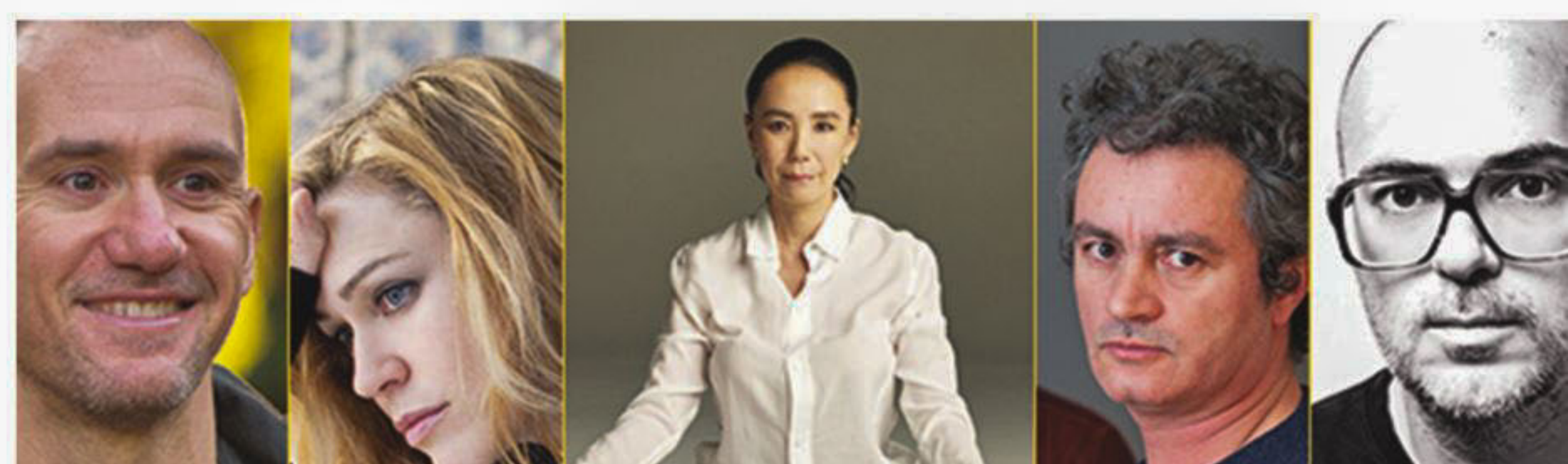
Jury for Short Films