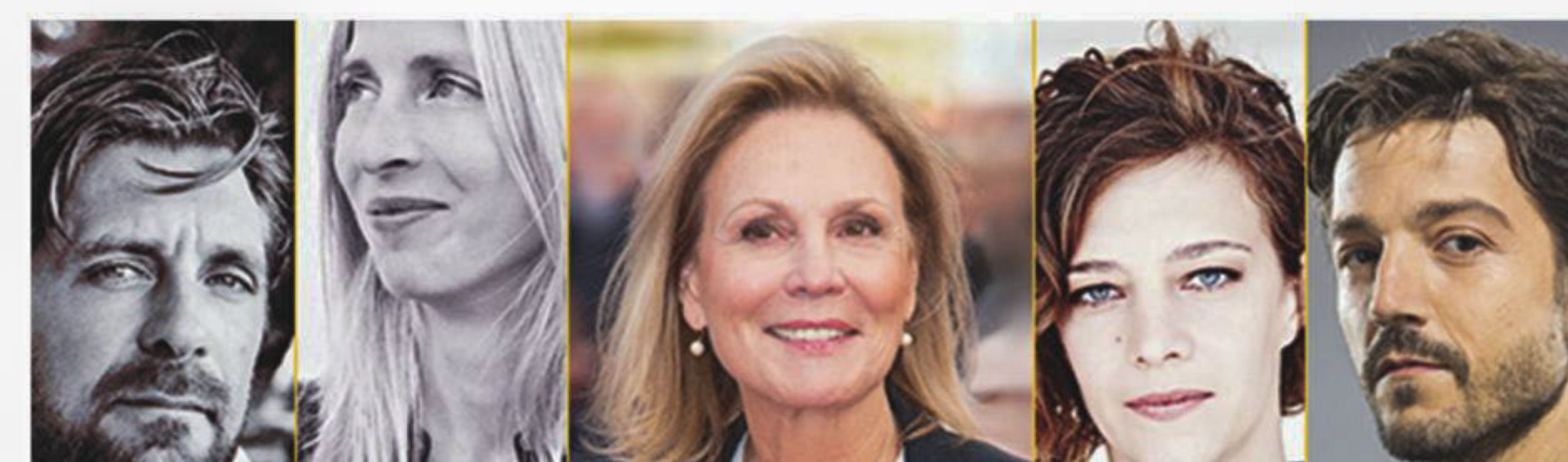
Jury for Un Certain Regard