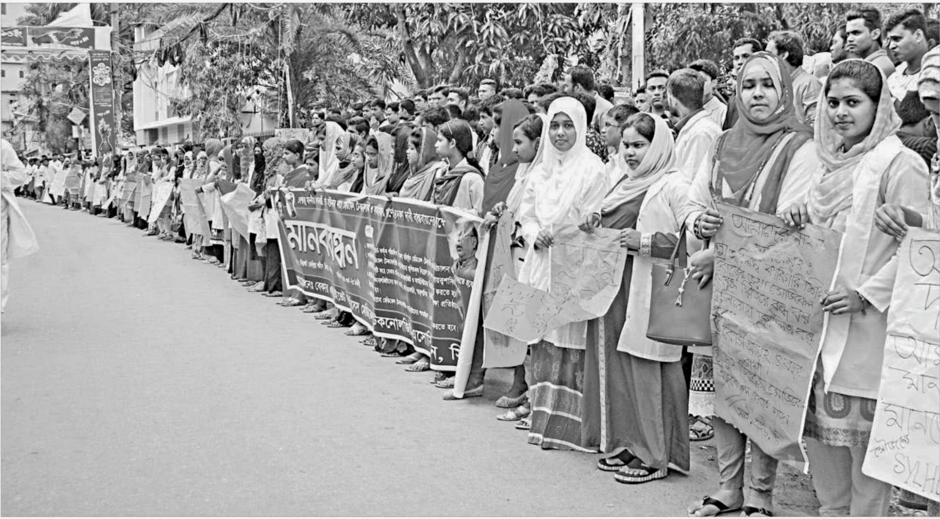
Medical assistant training students, unemployed graduates and professionals form a human chain in front of Sylhet Central Shaheed Minar yesterday as part of their ongoing countrywide campaign to realise their five-point demand, consisting of arranging higher education, creating new posts and posting, upgrading status and salaries, establishing separate education board and forming regulation and giving allowances for the internees.