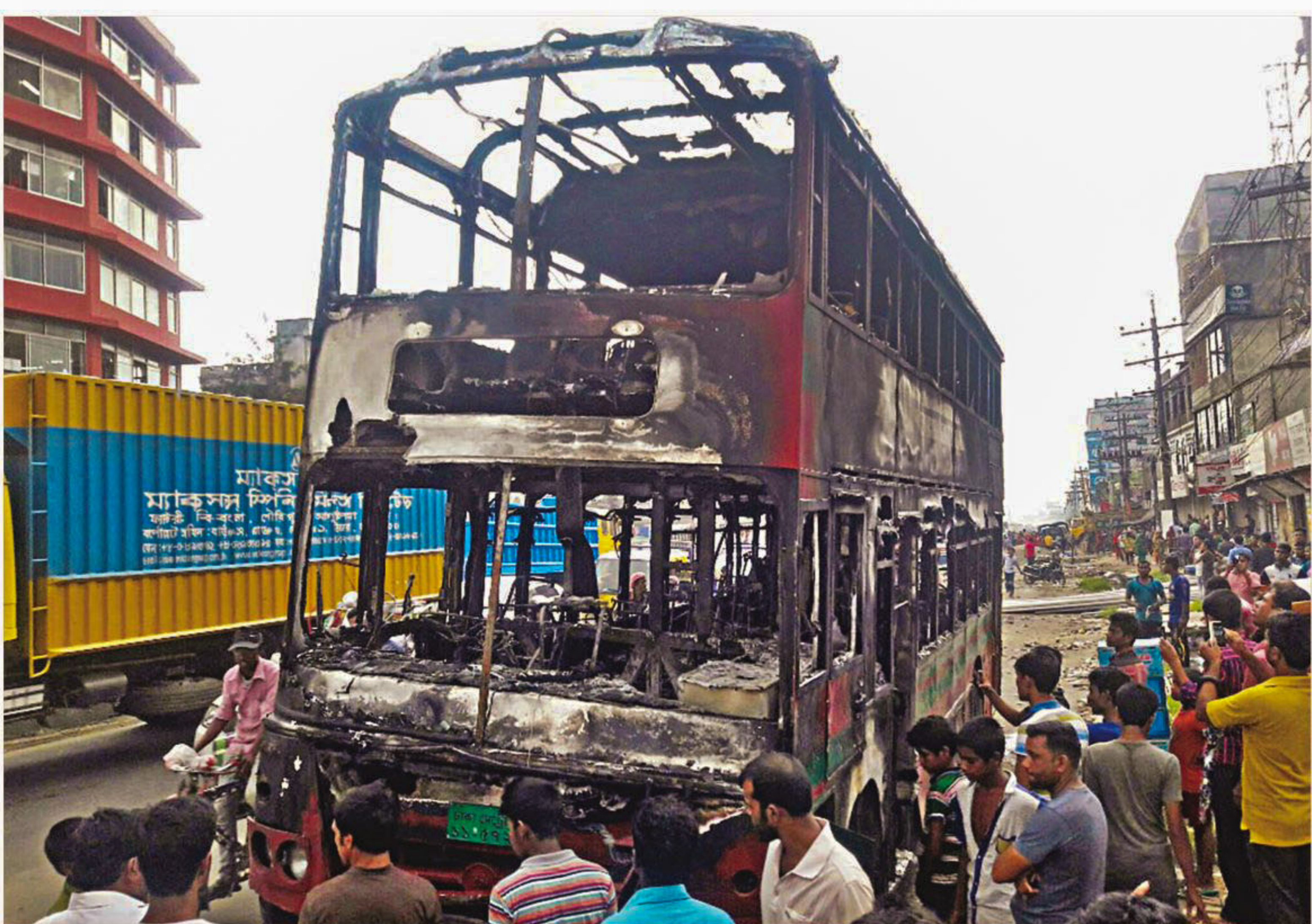
The remains of a BRTC bus after angry locals set fire to it following a road accident at Chandana intersection in Gazipur yesterday, in which two siblings died as a motorbike they were riding hit the vehicle from behind.