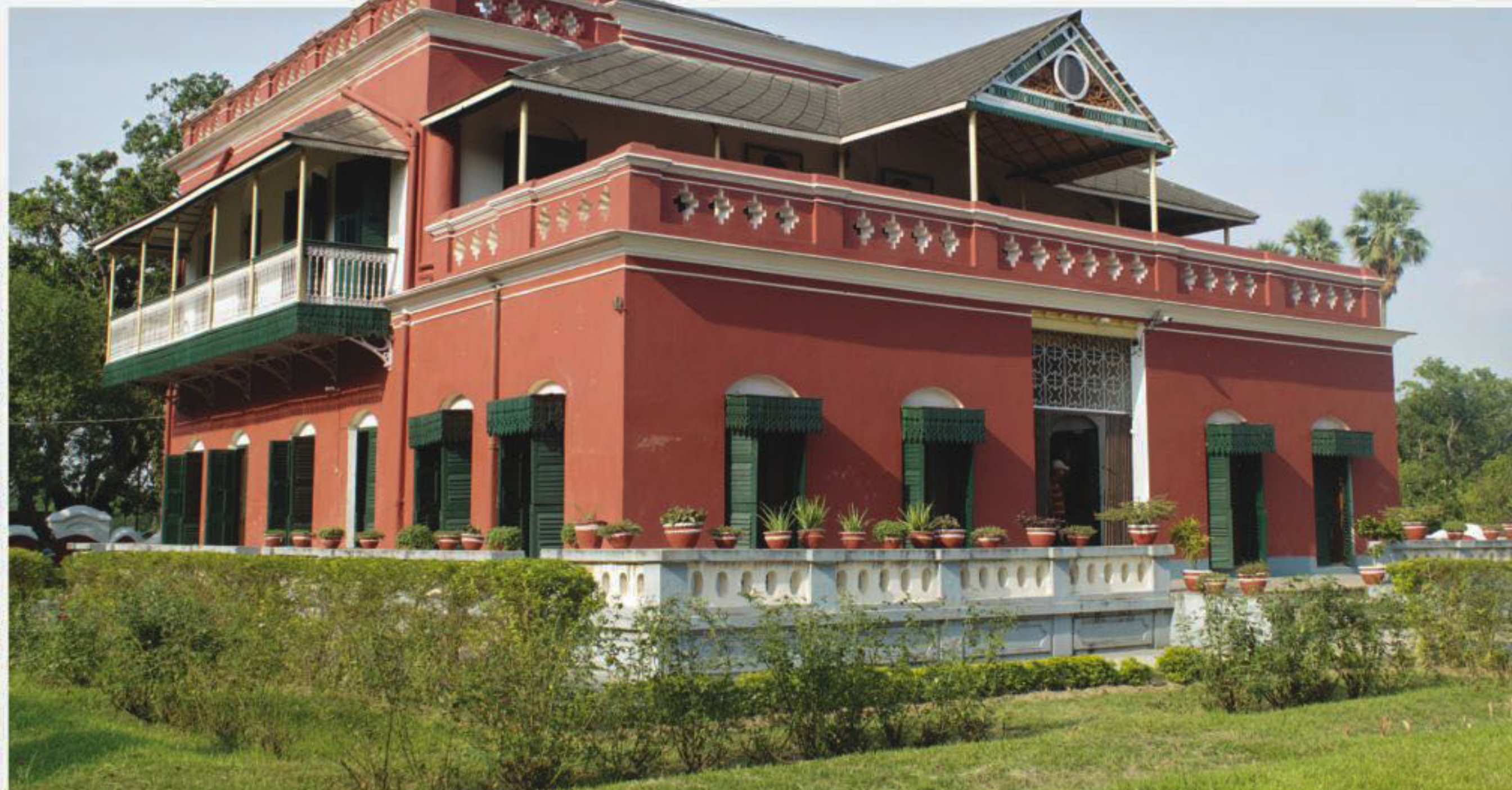
ZAHANGIR ALAM, back from Shilaidaha

Shilaidaha Kuthibari at Kumarkhali upazila in Kushtia is one of the must see stops in the itinerary of Tagore enthusiasts. The beautiful red sprawling building surrounded by a large expanse of trees, plants and blooming flowers, is located about 20 km away from Kushtia town. The Kuthibari inextricably holds the memory of Nobel Laureate Poet Rabindranath Tagore who made frequent visits here in connection with his "Zamindari" (estate).