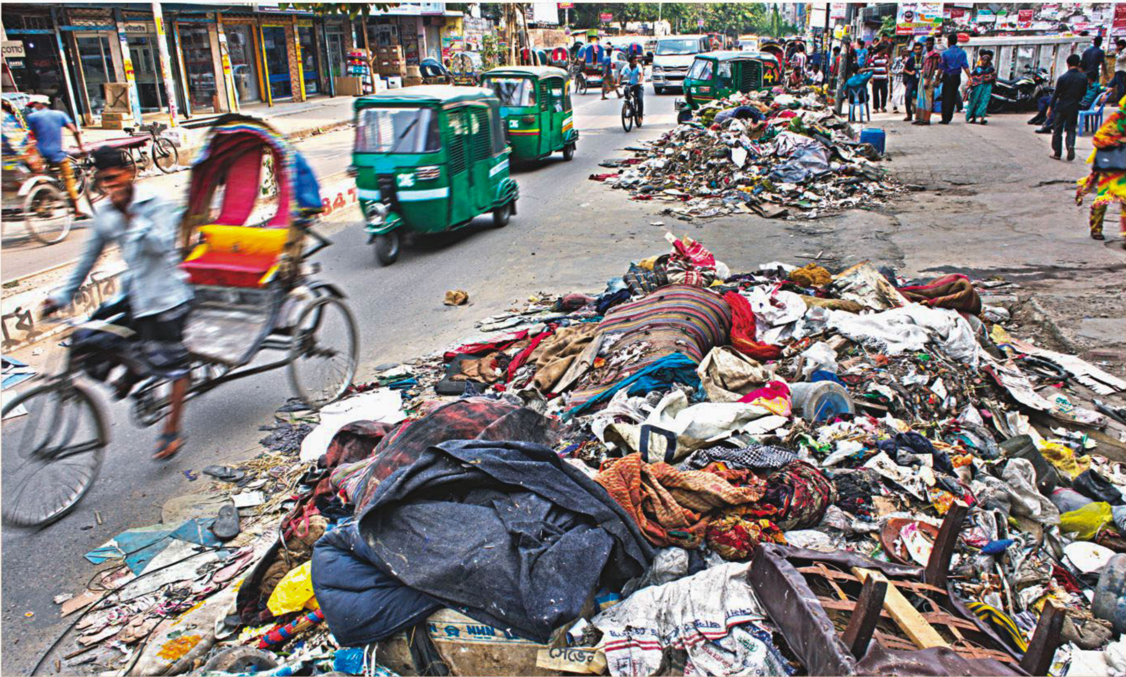
These burnt out debris used to be people's belongings, destroyed due to a fire at a slum in the capital's Green Road area. It has been over eight days and the piles of wreckage remain untouched occupying almost an entire side of the street, amidst the city corporations' campaign for a cleaner city. The photo was taken yesterday.

A representative democratic government is therefore needed through holding a competitive national election to get rid of such situations, she emphasised.