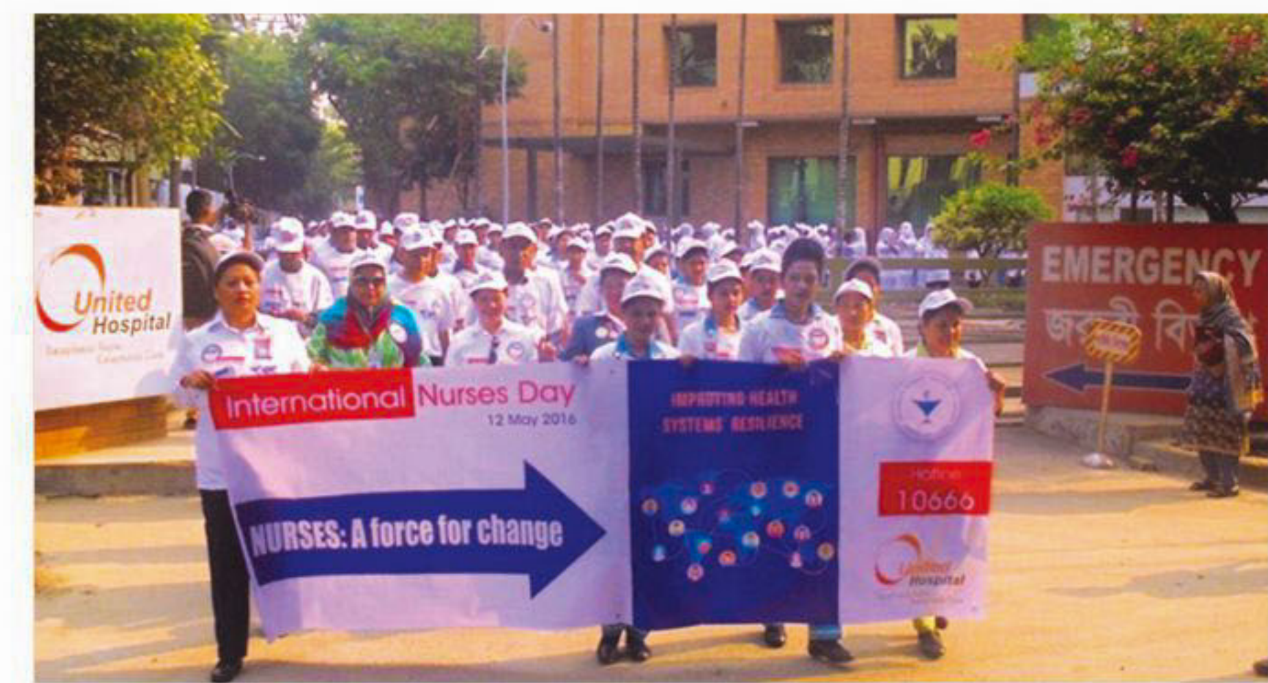
United Hospital in the capital brings out a rally on its premises yesterday, marking International Nurses Day-2016.