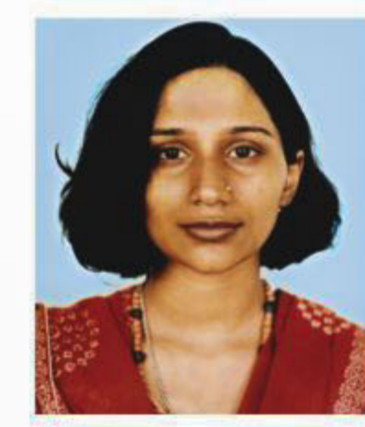
SHAZNEEN RAPE, MURDER CASE