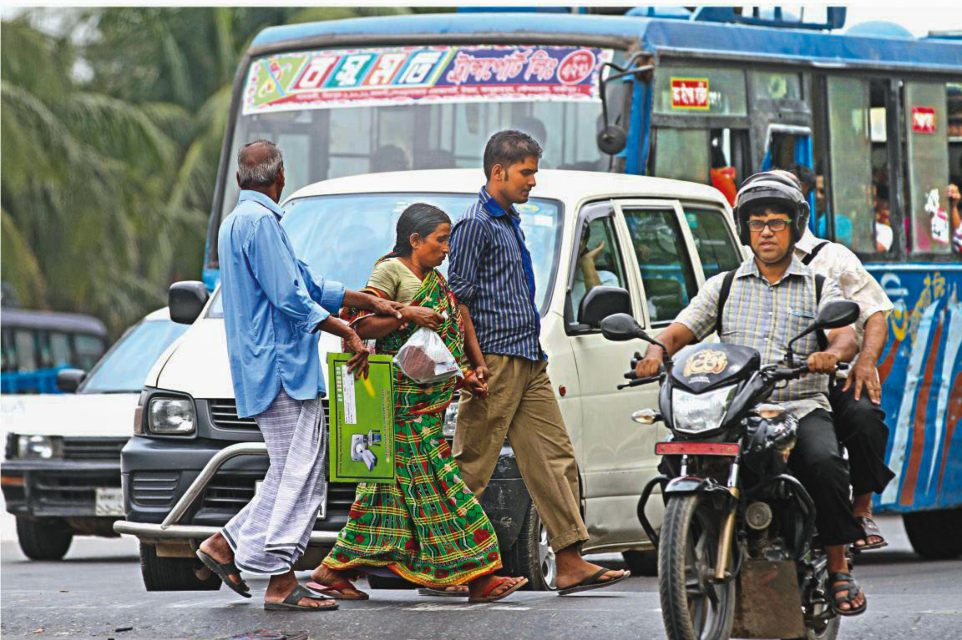
A female patient along with her relatives crossing the Airport Road through oncoming traffic to go to the city's Kurmitola General Hospital, bottom left. A foot-bridge is essential there as people have to risk their lives to cross the busy street, Bottom right. The photos were taken last month.