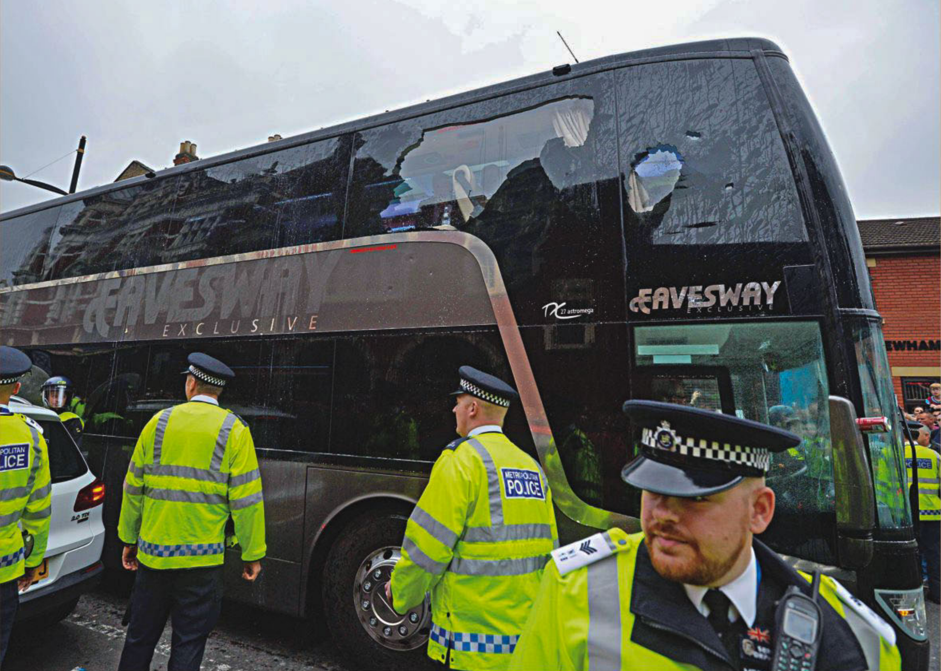
The bus carrying the Manchester United team is escorted by police after having a window smashed on its way to West Ham's Boleyn ground before their Premier League encounter on Wednesday.

"Their behaviour was unacceptable and won't be stood for. But my overriding memory will not be of them but of a fitting farewell to the Boleyn."