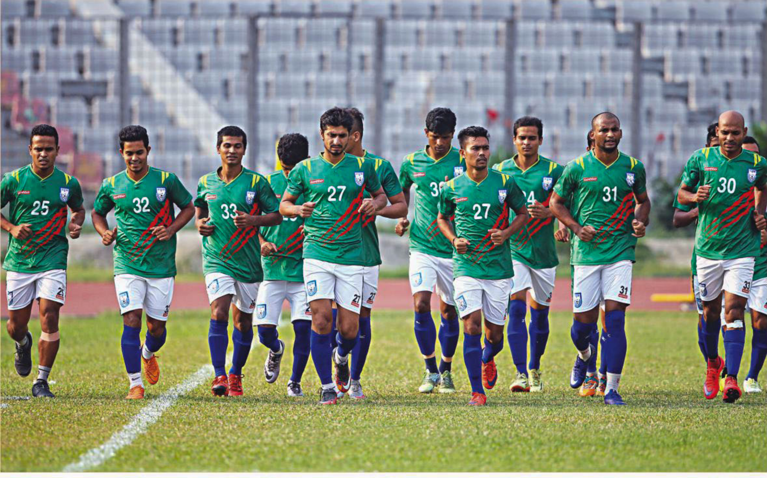
Booters jog around the Bangabandhu National Stadium pitch on the first day of training camp for next month's double-legged Asian Cup qualifying playoffs. Out of the 34 called up to camp, only 21 took part yesterday.