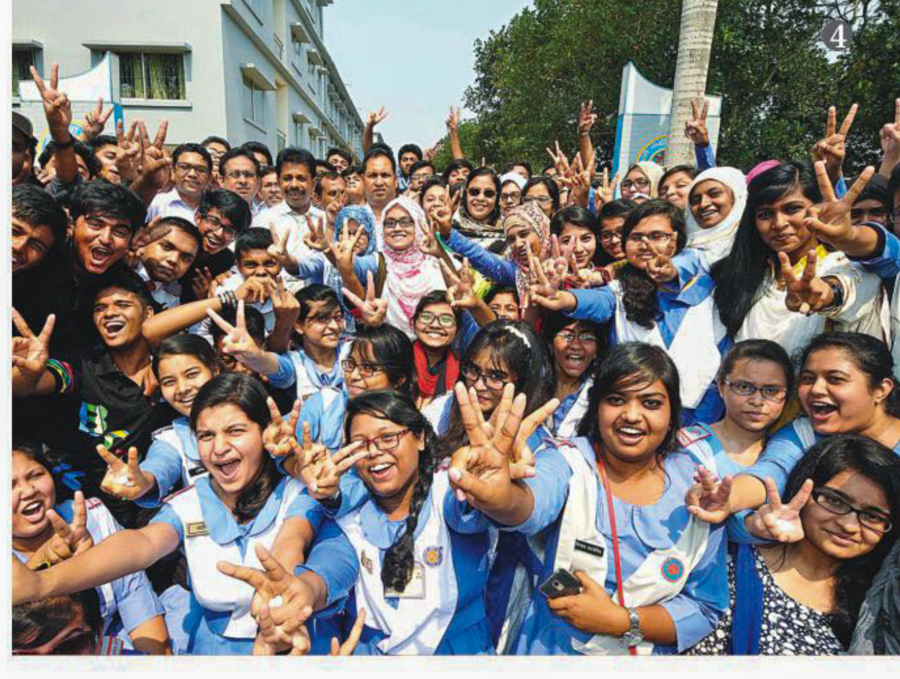
JOY OF SUCCESS: GPA-5 achiever students of 1) Amana Baki Residential Model College and College in Chiribandar upazila under Dinajpur district, 2) Bidyamoyee Government Girls' High School in Mymensingh town, 3) Mirzapur Cadet College in Tangail, and 4) Bogra Cantonment School and College flash V-sign on the premises of their institutions after publication of the SSC examination results yesterday.