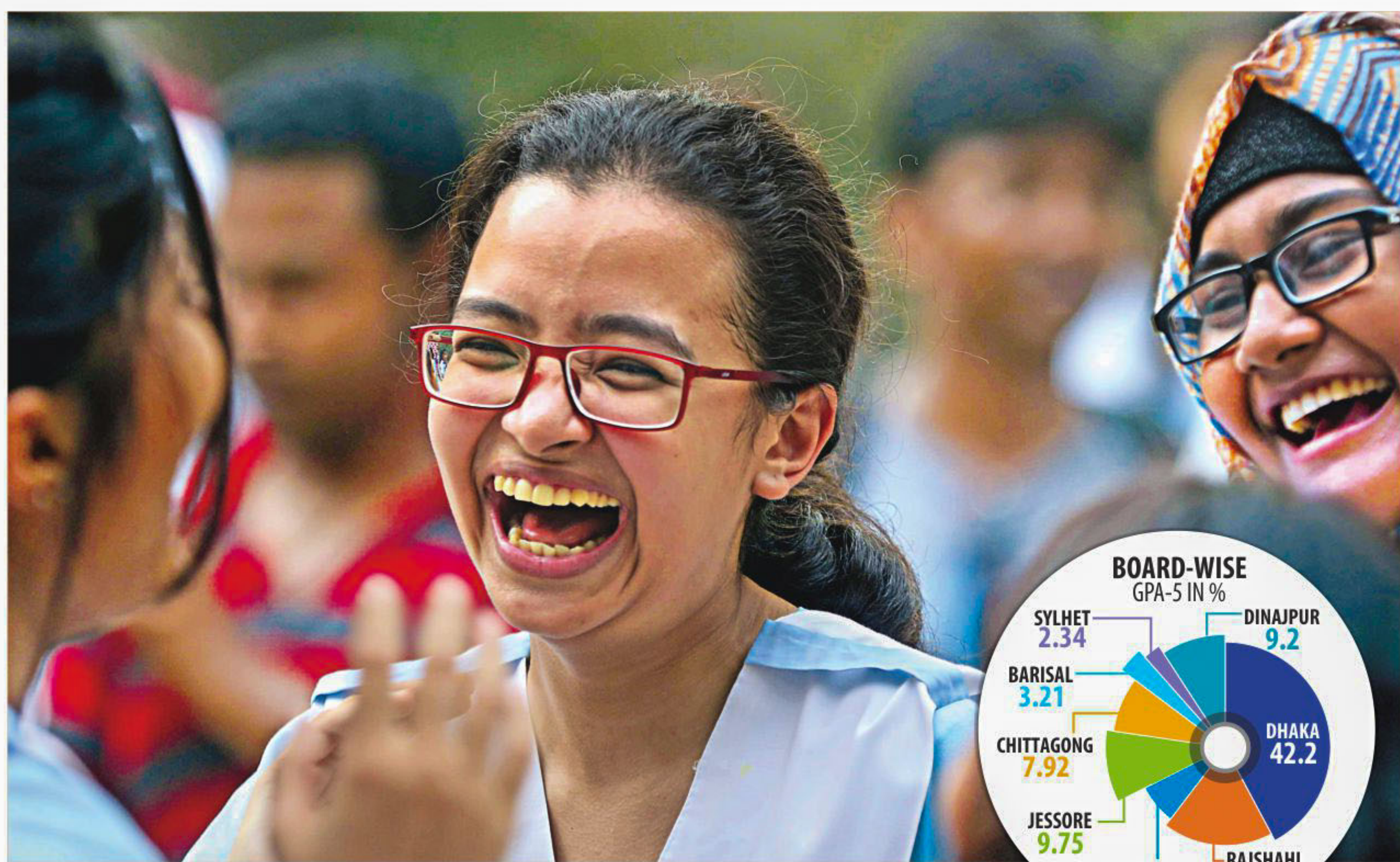
A jubilant student of Viqarunnisa Noon School in the capital with friends after the SSC results were published yesterday.