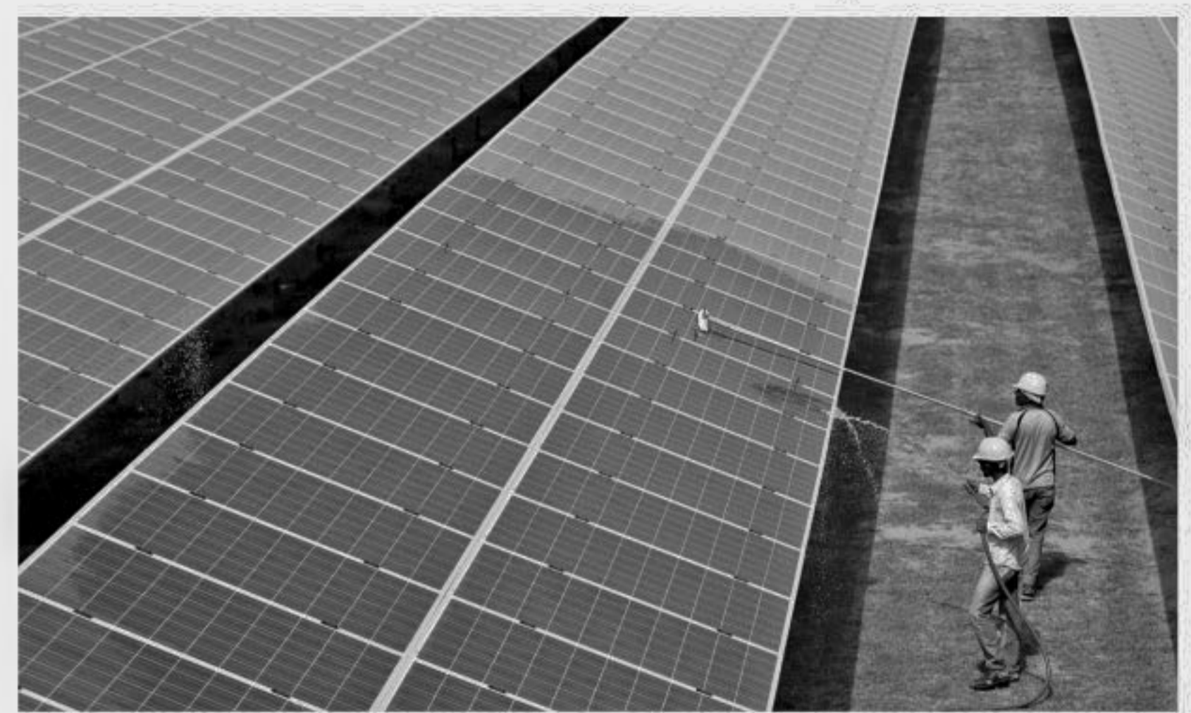
Workers clean photovoltaic panels inside a solar power plant in India.

"Emerging markets are transforming their energy industries at an unprecedented pace," said Ben Warren, energy corporate finance