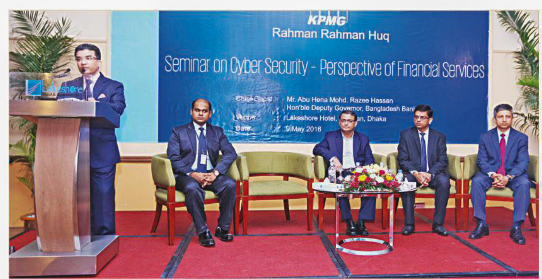
Analysts attend a seminar on the cyber security of financial services organised by Rahman and Rahman Huq (a member of KPMG in Bangladesh), at Lakeshore Hotel in Dhaka on Monday.

Most civil servants have already completed salary updates online since the system's introduction on December 15 last year, but some still remain, for various reasons including the lack of national ID cards.