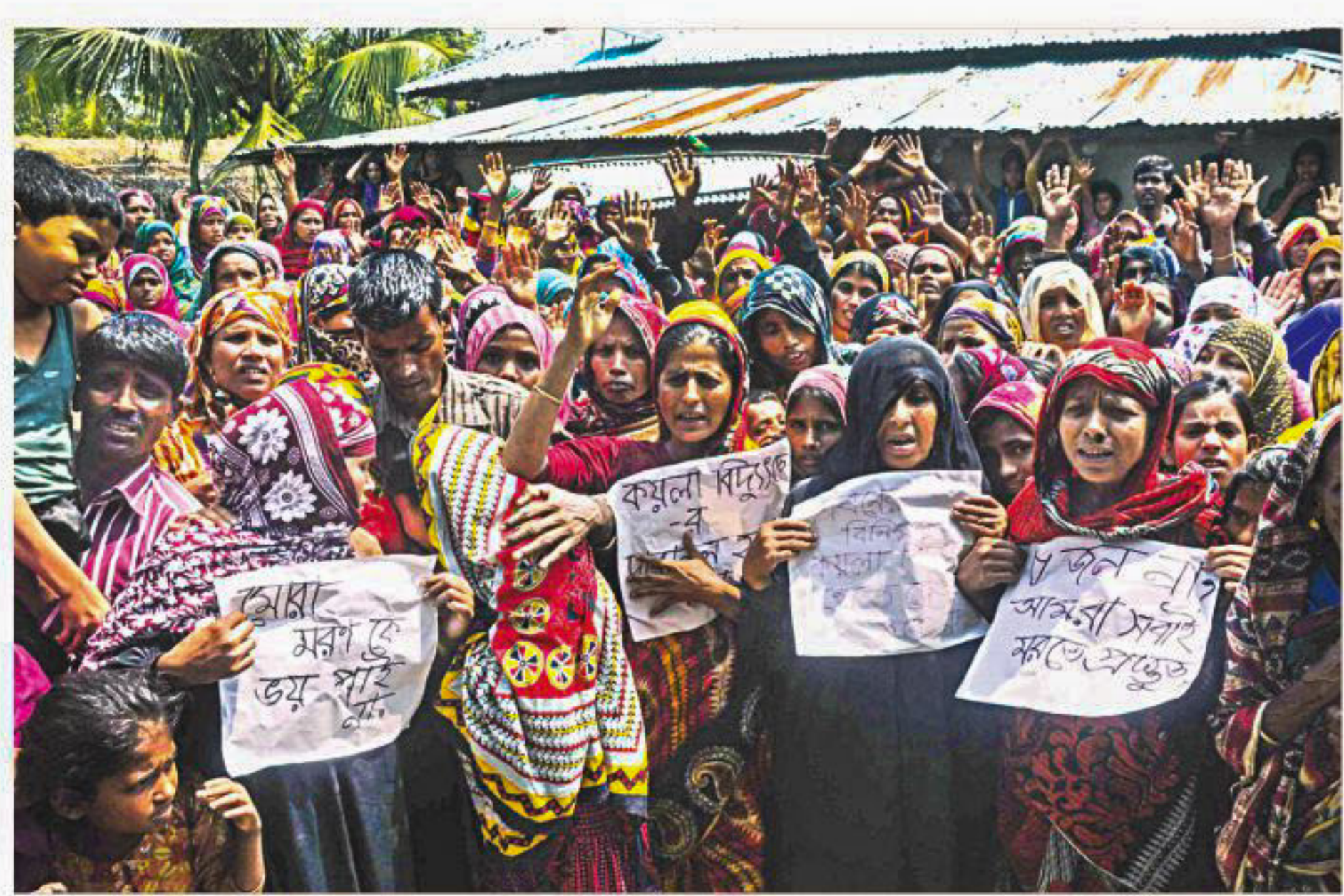
A file photo of the locals of Banshkhali upazila in Gondamara union of Chittagong protesting setting up of a coal-fired power plant there.