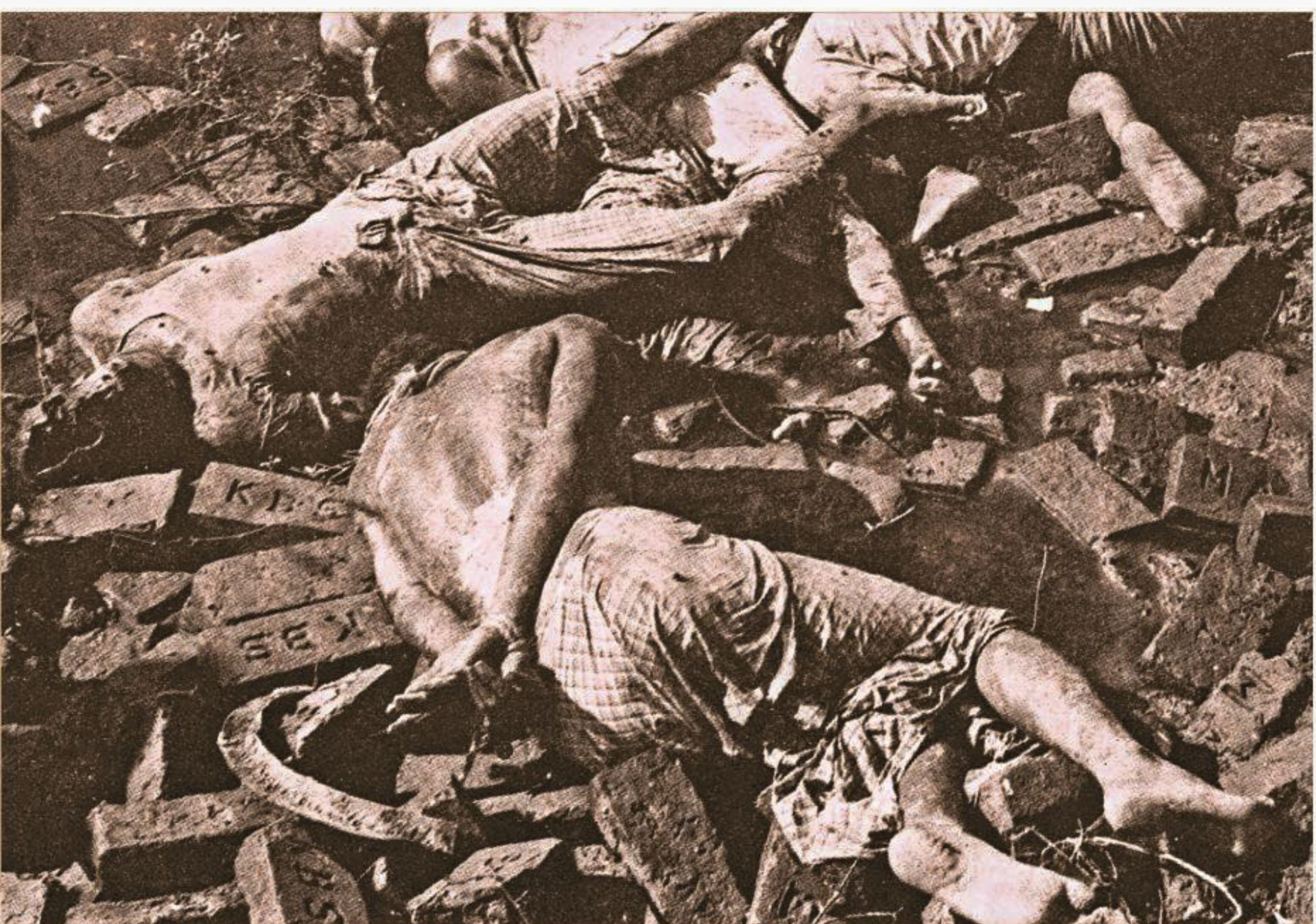
Bodies of freedom-loving people dumped in the Rayerbazar killing field in 1971.

A total of 26 family members, including his wife, daughters and sons went inside the jail at 7:50pm.