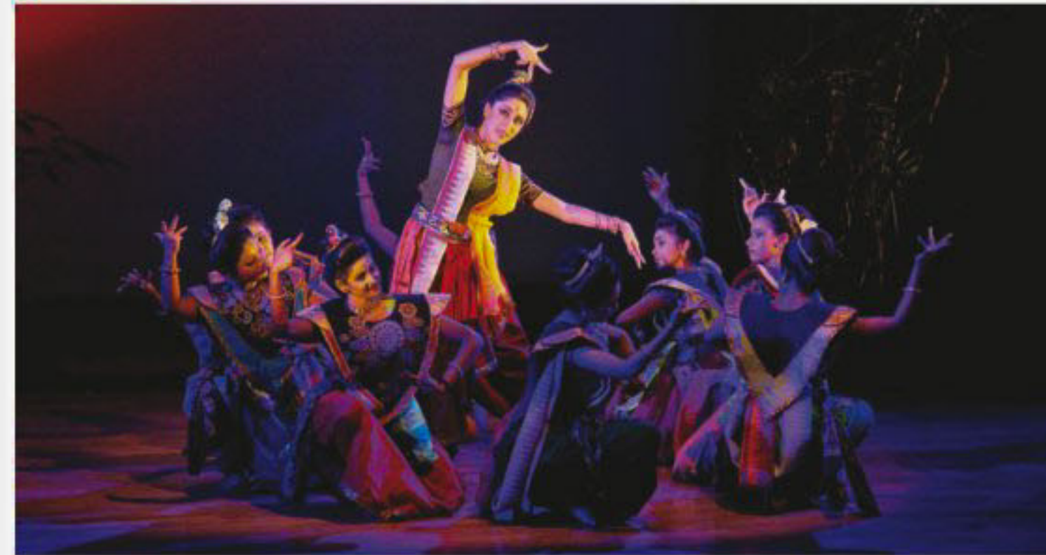
A scene from "Chitrangada".

As part of Star Melodies, The Daily Star's regular initiative to promote Bangla music, a soiree highlighting songs of Tagore's lyrical dramas and dance dramas will be held on Friday, May 13 at The Daily Star-Bengal Arts Precinct.