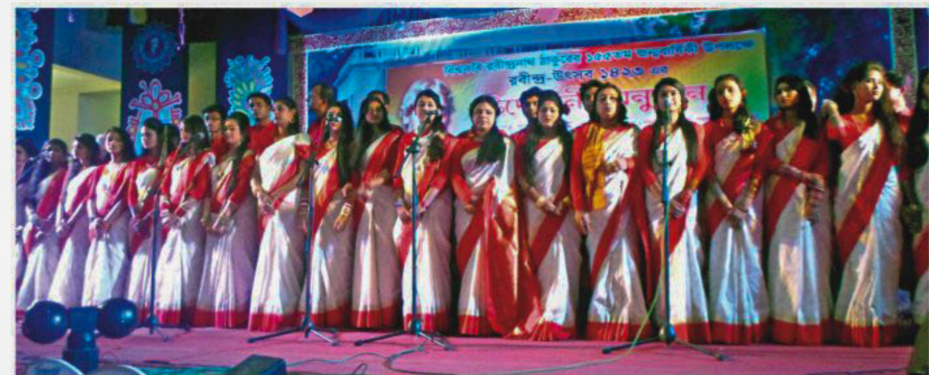
Artistes render a chorus.