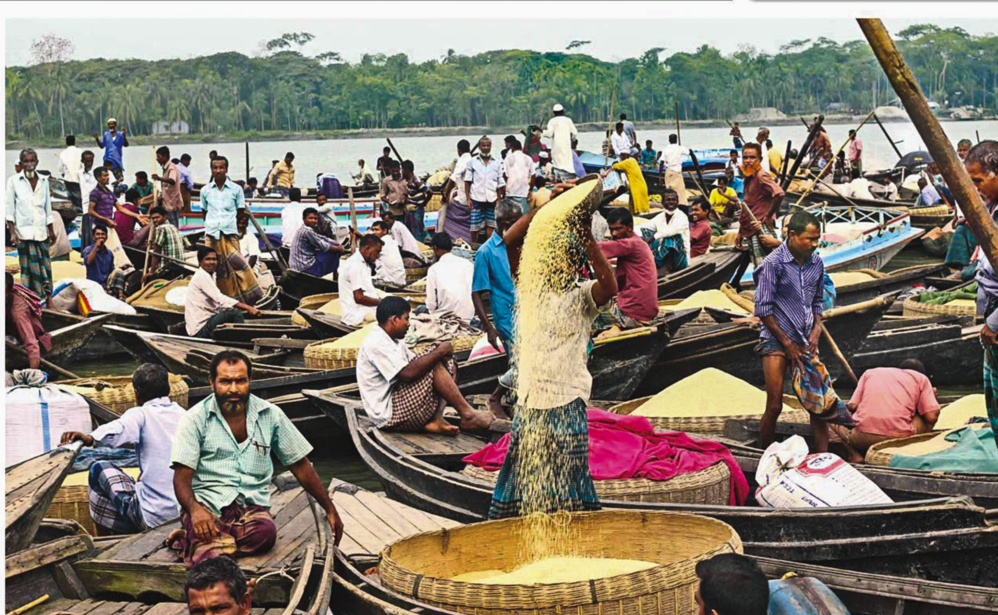
A floating market of rice grains on the Sandha river. The market is open for business twice a week when farmers of the region gather there with their produce. Unlike before, traders from afar do not go to this market to buy their goods but the miniket variety of rice, produced by the farmers themselves, is extremely popular at the market.