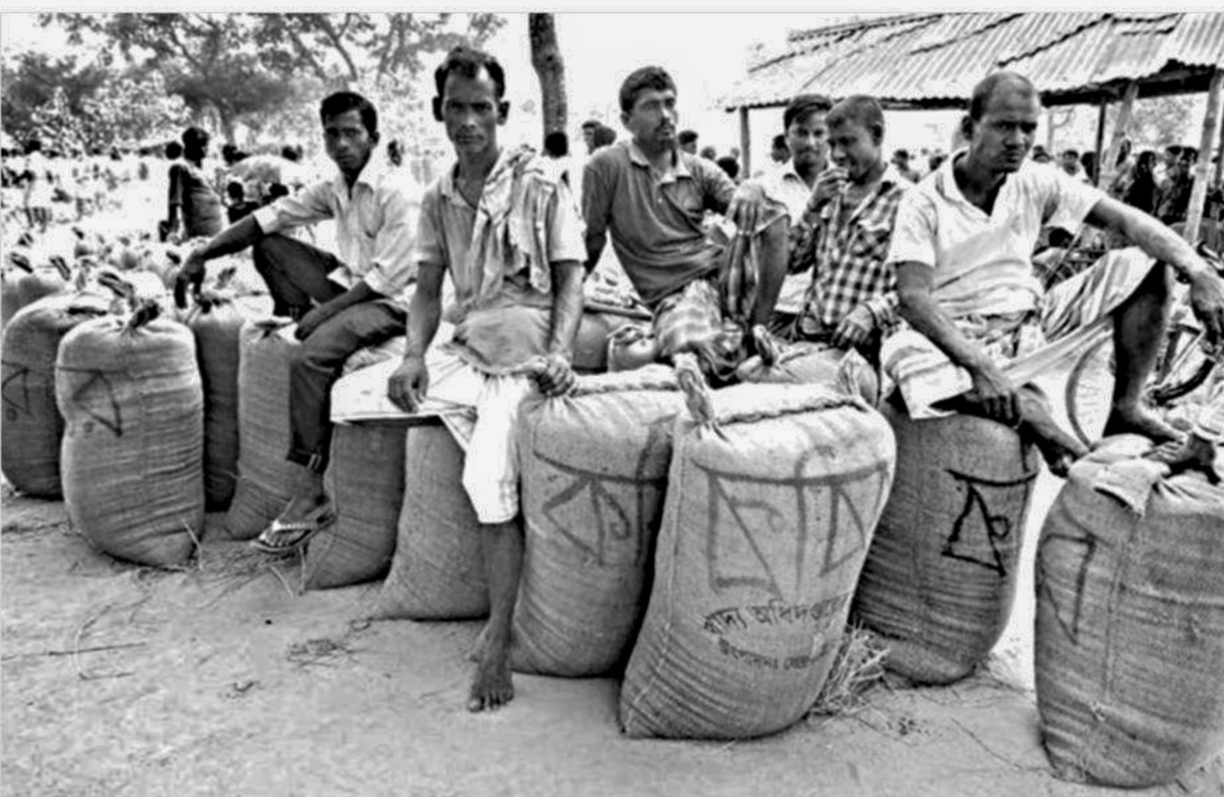
Farmers with their newly harvested boro paddy look frustrated at Dhelapir Bazar in Nilphamari Sadar upazila as the market, like several others in the district, sees very few customers and the offered prices remain too low.