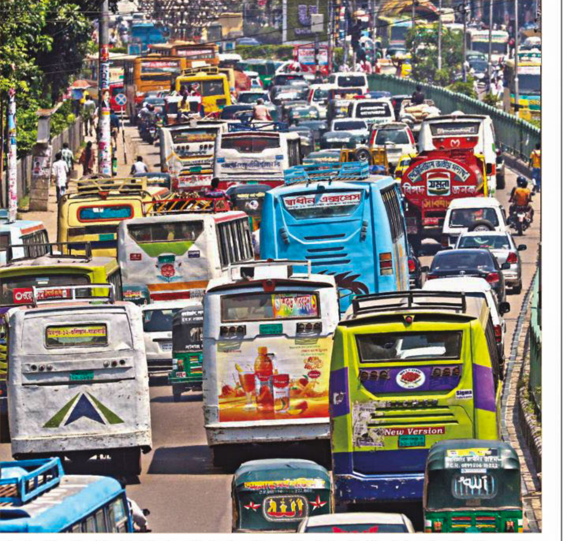
The traffic situation in Dhaka city during Jamaat-e-Islami's hartal yesterday. Except for the inter-district buses, all types of public transport were on the street and it was like a normal day. The party called the strike protesting upholding of the death penalty of party chief Motiur Rahman Nizami, who was convicted of committing war crimes in 1971. The photo was taken on Kazi Nazrul Islam Avenue near Karwan Bazar.