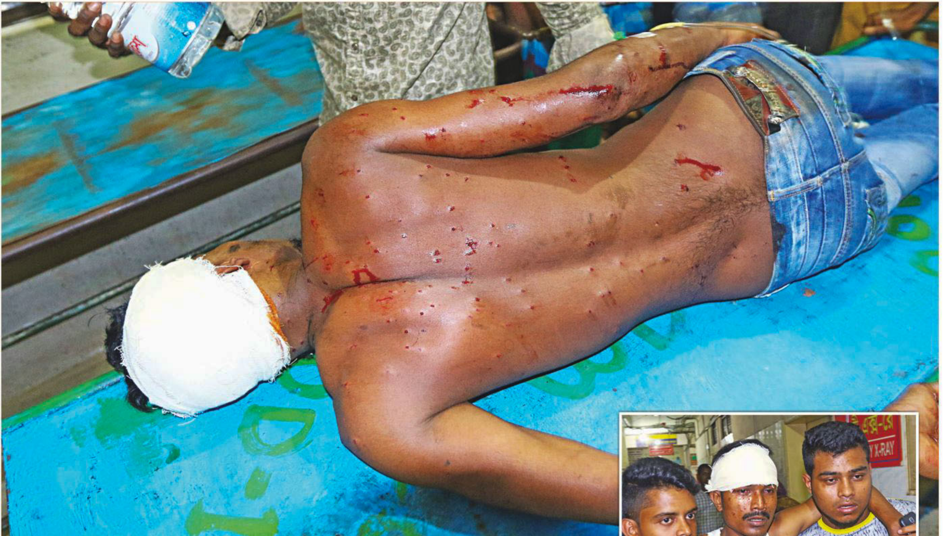
The back of a youth riddled with shotgun pellets at Dhaka Medical College Hospital. He was one of those injured in a clash between the supporters of two ruling Awami League lawmakers in the capital's Mirpur 1 yesterday. Inset, another man with pellets lodged in the face being shifted from one room to another at the hospital. The fighting started over holding of yesterday's anti-hartal processions, in front of Mukta Bangla Shopping Complex.