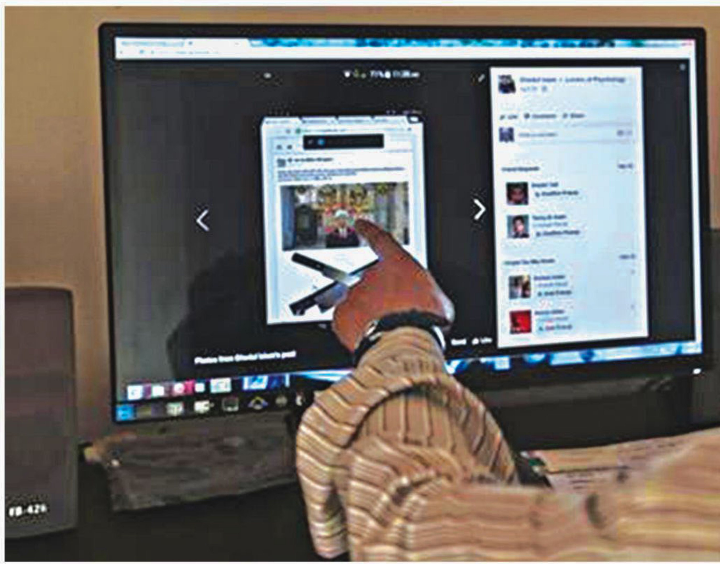
A Dhaka University professor shows the AP news agency the threat on his life he received on Facebook for asking a girl in his class, who had her face covered, to unveil her face so that he could identify her.