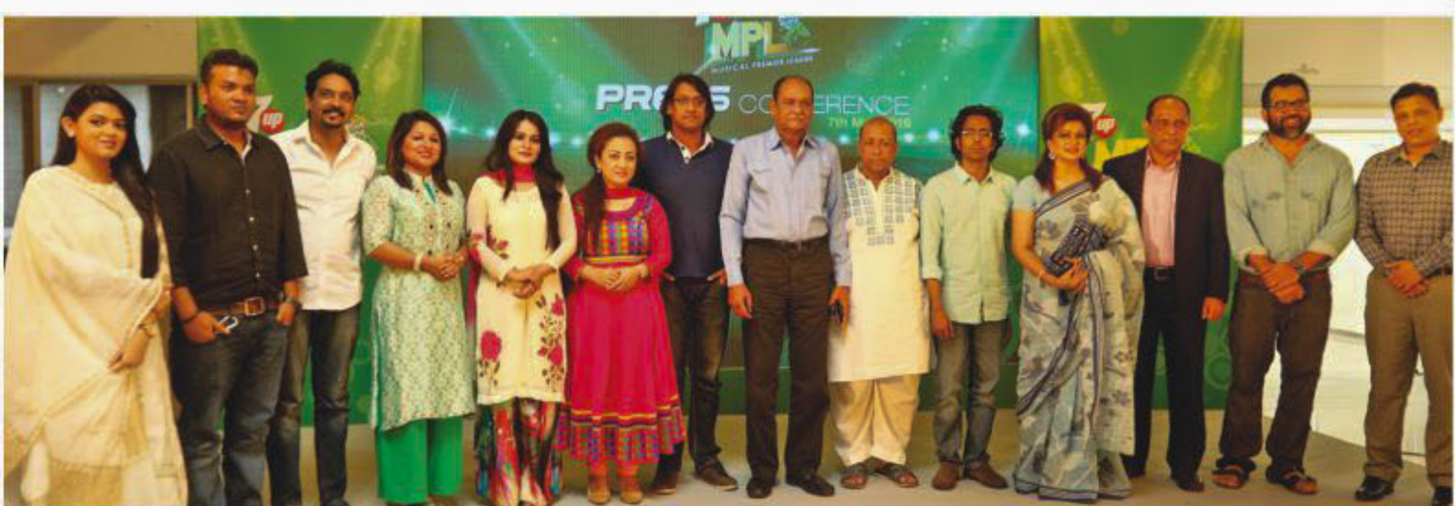
Guests present at the press conference pose for a group photo.