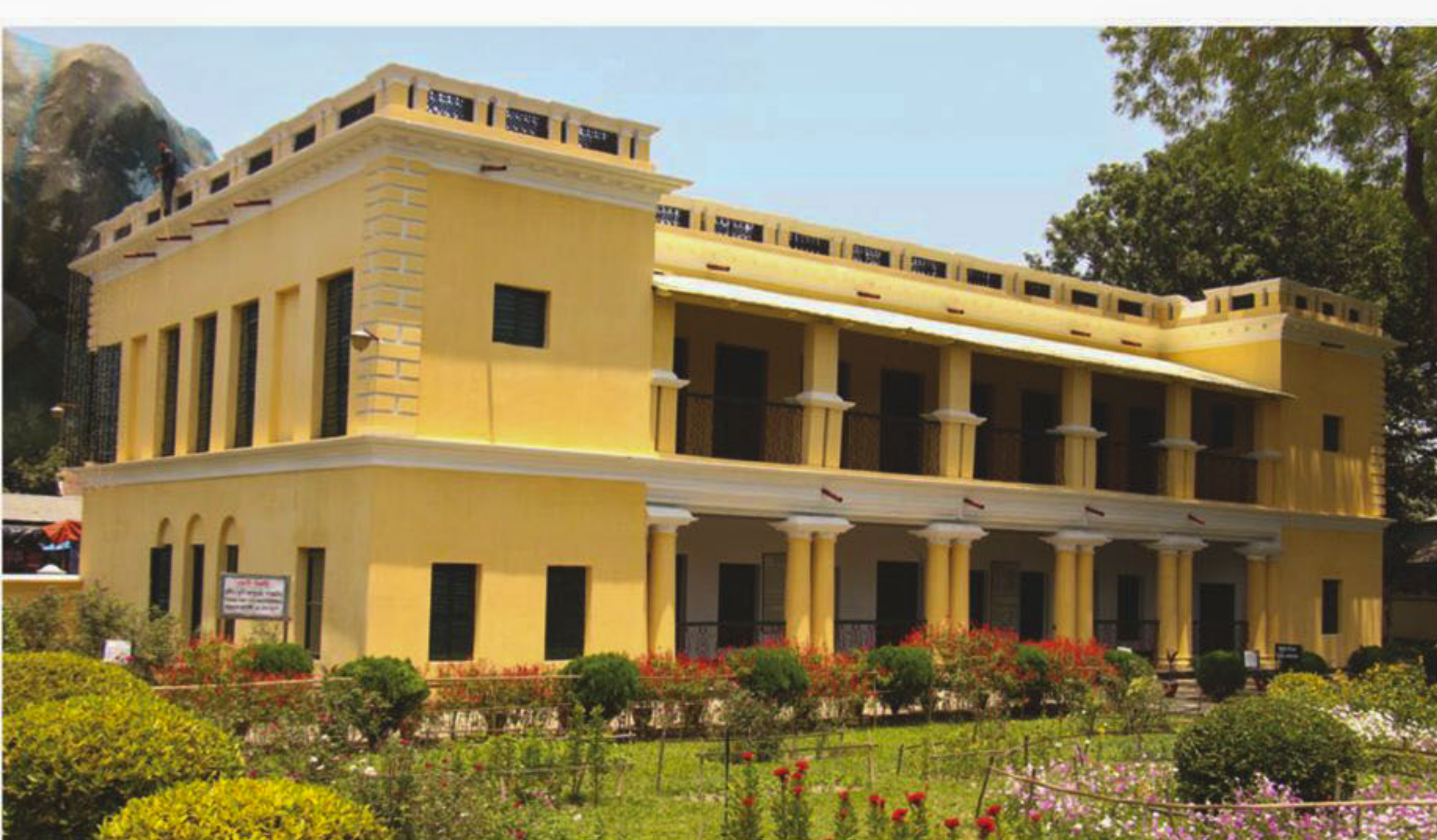
The iconic Kachharibari will buzz for the next three days.