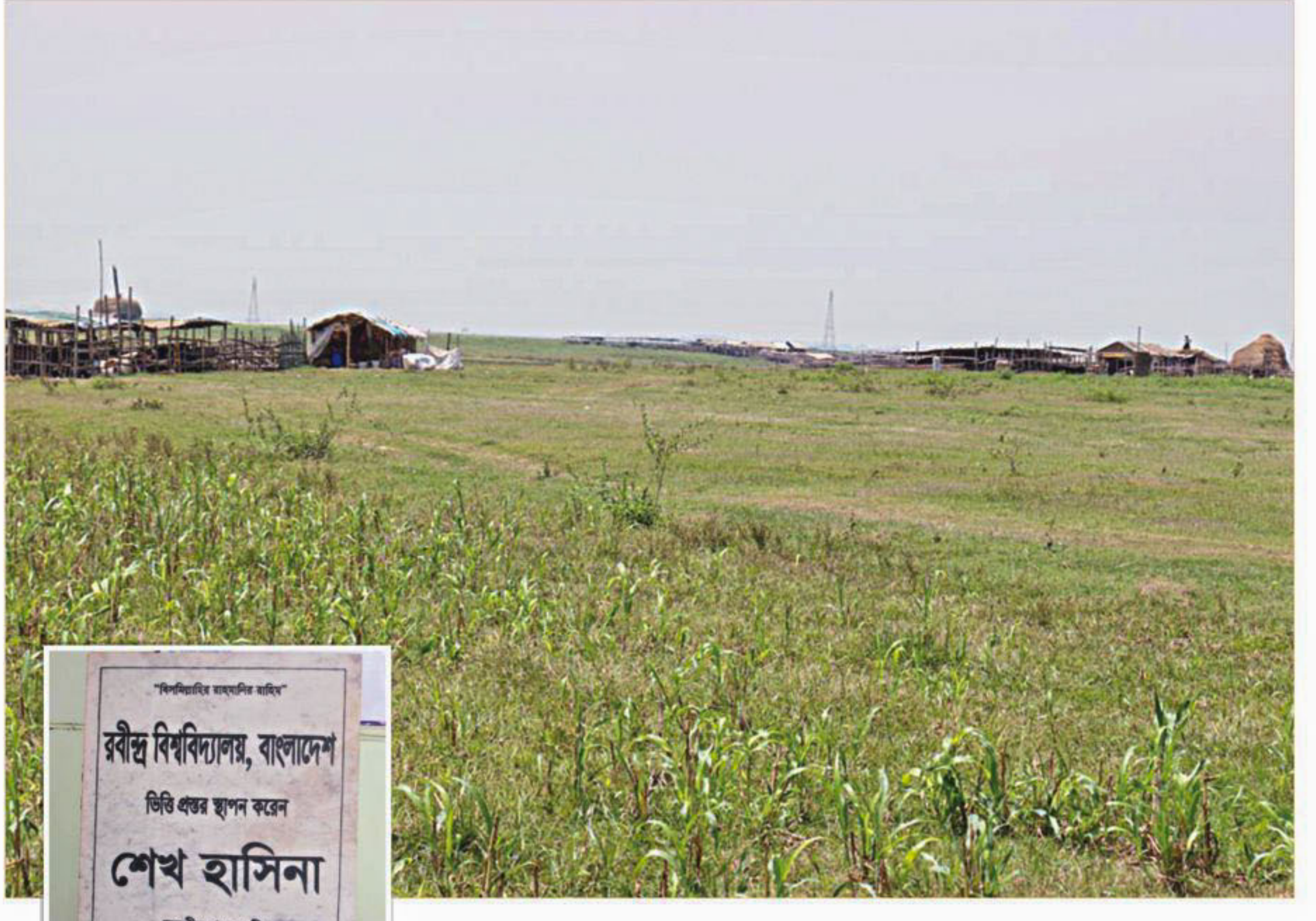
The designated site for the Rabindra University in Rautara area has seen almost no development work. The foundation stone, inset, for Rabindra University, which Prime Minister Sheikh Hasina laid a year ago, is now left leaning on a wall at the Shahzadpur UNO office in Sirajganj.