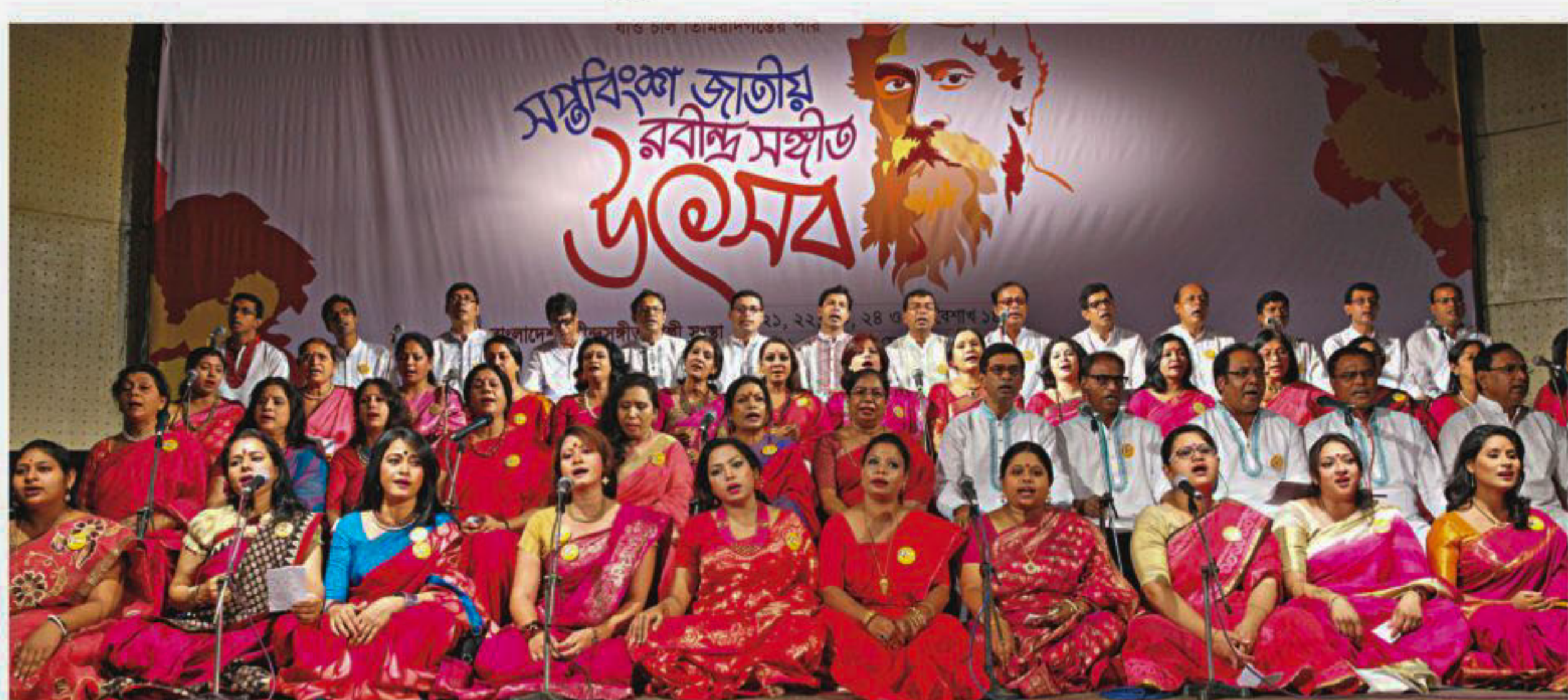
Artistes render a chorus on the opening day.