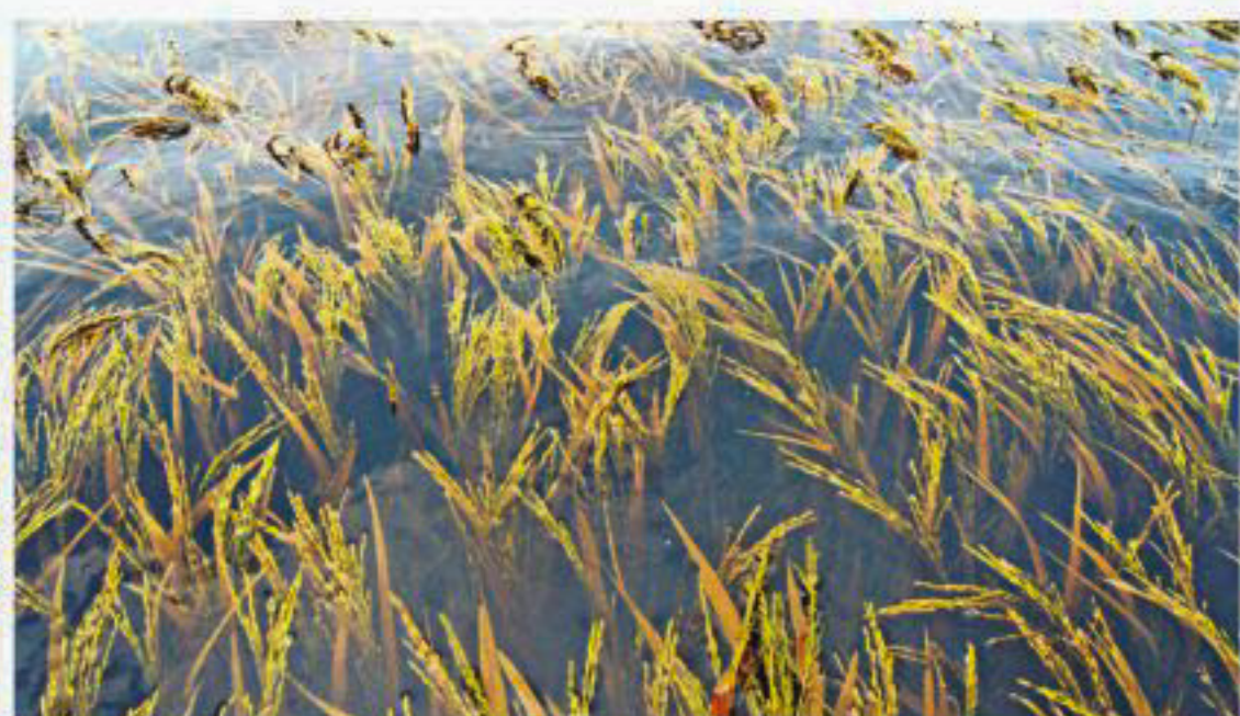
Flash floods triggered by heavy rain over the last few days have caused extensive damage to Boro paddy in haor areas of Sylhet's Bianibazar, Balaganj and Osmaninagar upazilas. In the photos taken yesterday, a farmer is seen harvesting paddy at Pukriya Haor in Khadim Nagar union of the district. Bottom left , a paddy field under water, and, a man threshing damaged paddy at Khaiya Haor in Fenchuganj, bottom right .