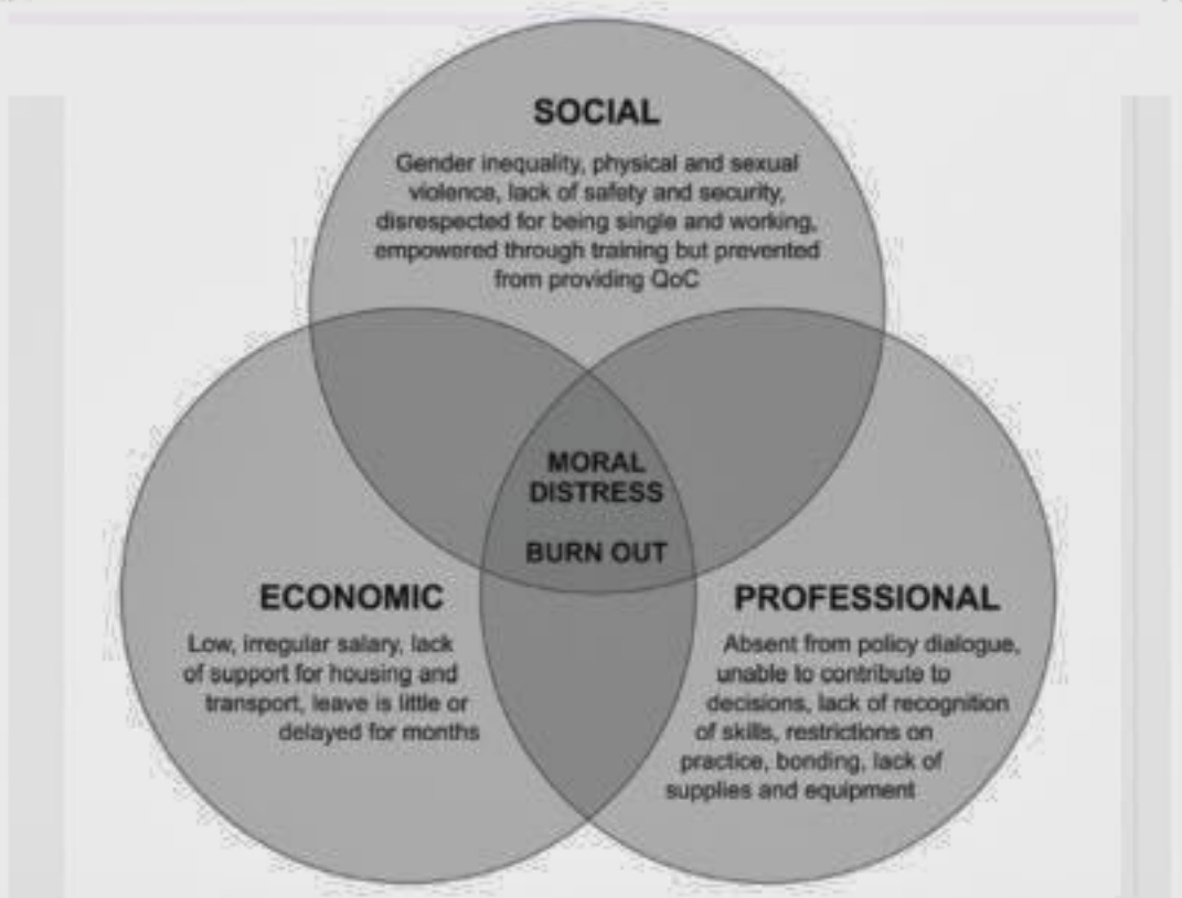
Figure 2: Summary from a recent global study on barriers on certified midwives ability to perform all services they are skilled to'.

"The Lancet series showed that midwifery was associated with improved and efficient use of resources and outcomes when provided by midwives who were educated, trained, licensed, and regulated, and that midwives were most effective when integrated into the health system in the context of effective teamwork, referral mechanisms, and sufficient resources". Such an enabling environment is critical if a midwife is to perform what she is trained to do. - The Midwifery Service Framework