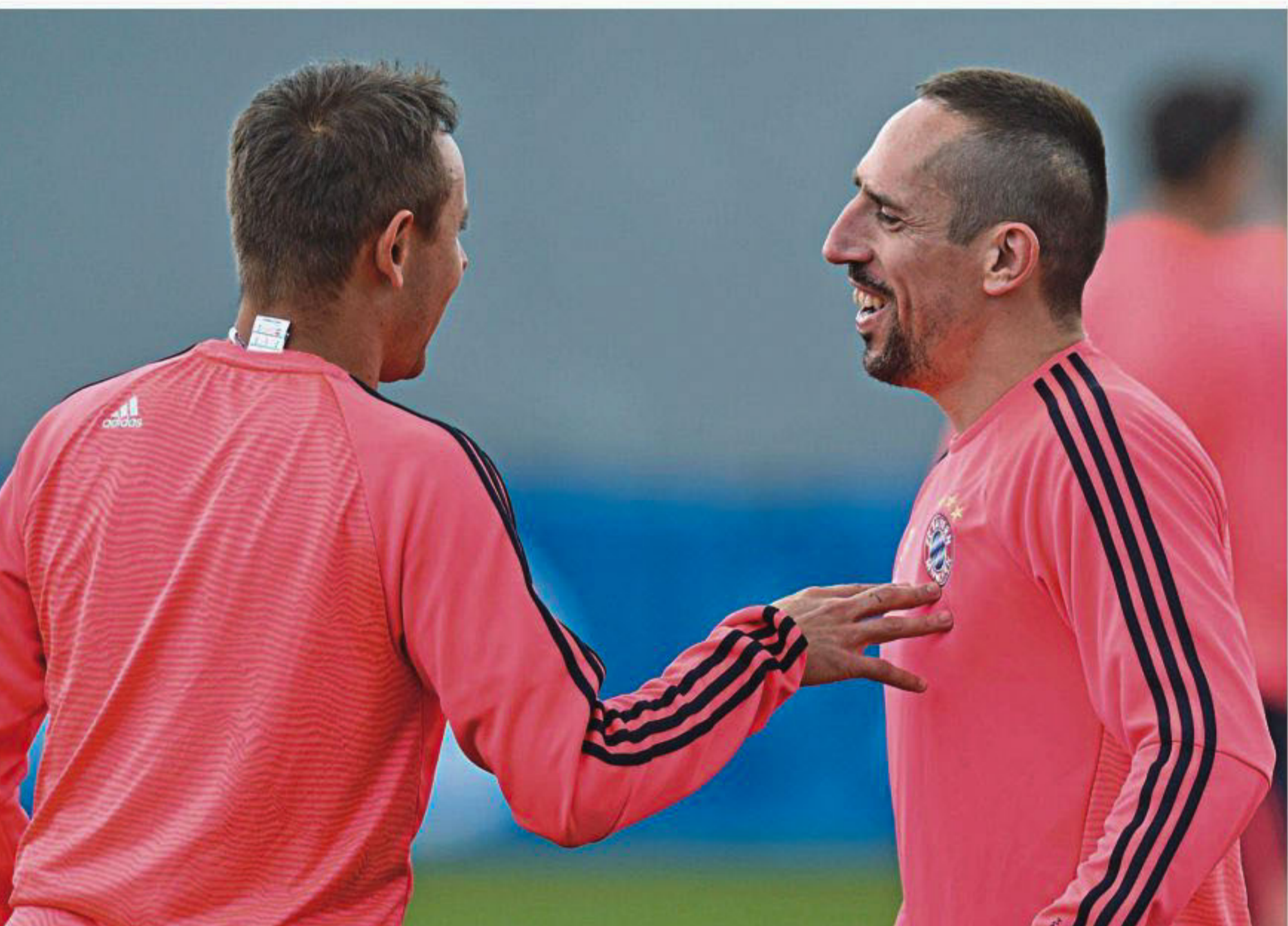
Bayern Munich defender Rafinha (L) shares a joke with teammate Franck Ribery during a training session in Munich yesterday on the eve of their Champions League semifinal second-leg against Atletico Madrid.

AFP, Madrid Seventeen-time Grand Slam champion Roger Federer withdrew from the Madrid Masters on Monday citing a back injury. However, the world number three remains hopeful that he will be fit to play in the Rome Masters next week as part of his preparation for the French Open later this month. "There's no feeling that I can practise so at this point I don't want to take more chances, as I know I won't be fully ready for Wednesday," said Federer. "I want to play it safe, rest up and get ready for Rome, that's the schedule now." Federer had taken a late decision to play in Madrid after missing nearly three months of the season due to knee surgery.