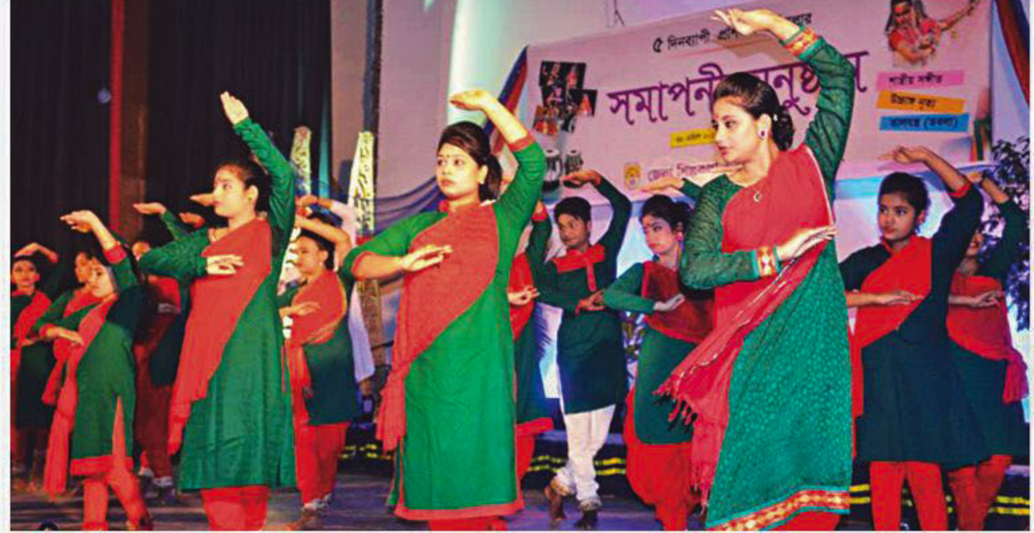
Participants of the training perform on the concluding day.