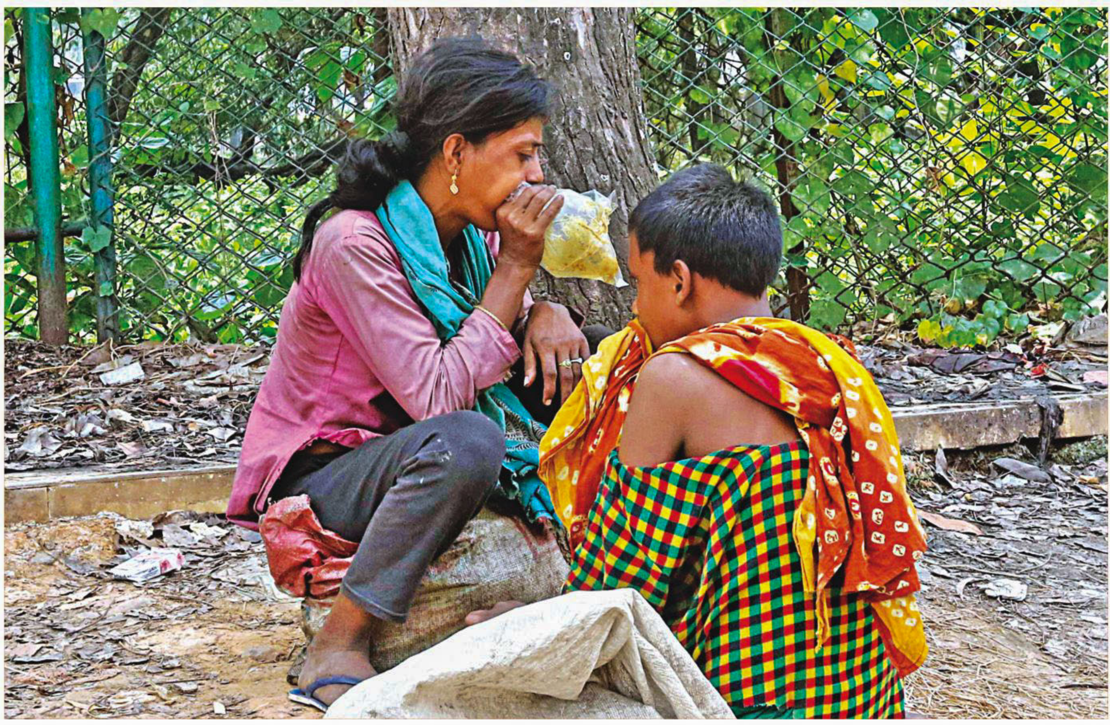
A girl sniffs glue on the footpath near Balaka Bhaban in the capital's airport area recently, for a quick high. Getting high used to be the bad habit of the rich, but life has brought tailored variety to the street kids of cities as well. Somebody got to pay attention as they are the children of the nation too.

They called upon the scholarship recipients to properly utilise the money in continuing their studies. "The language, culture, education, and literature are common between Bangladesh and India and these similarities have been playing a vital role in contributing to the progress and advancement of both the friendly nations," Tipu Munshi said.