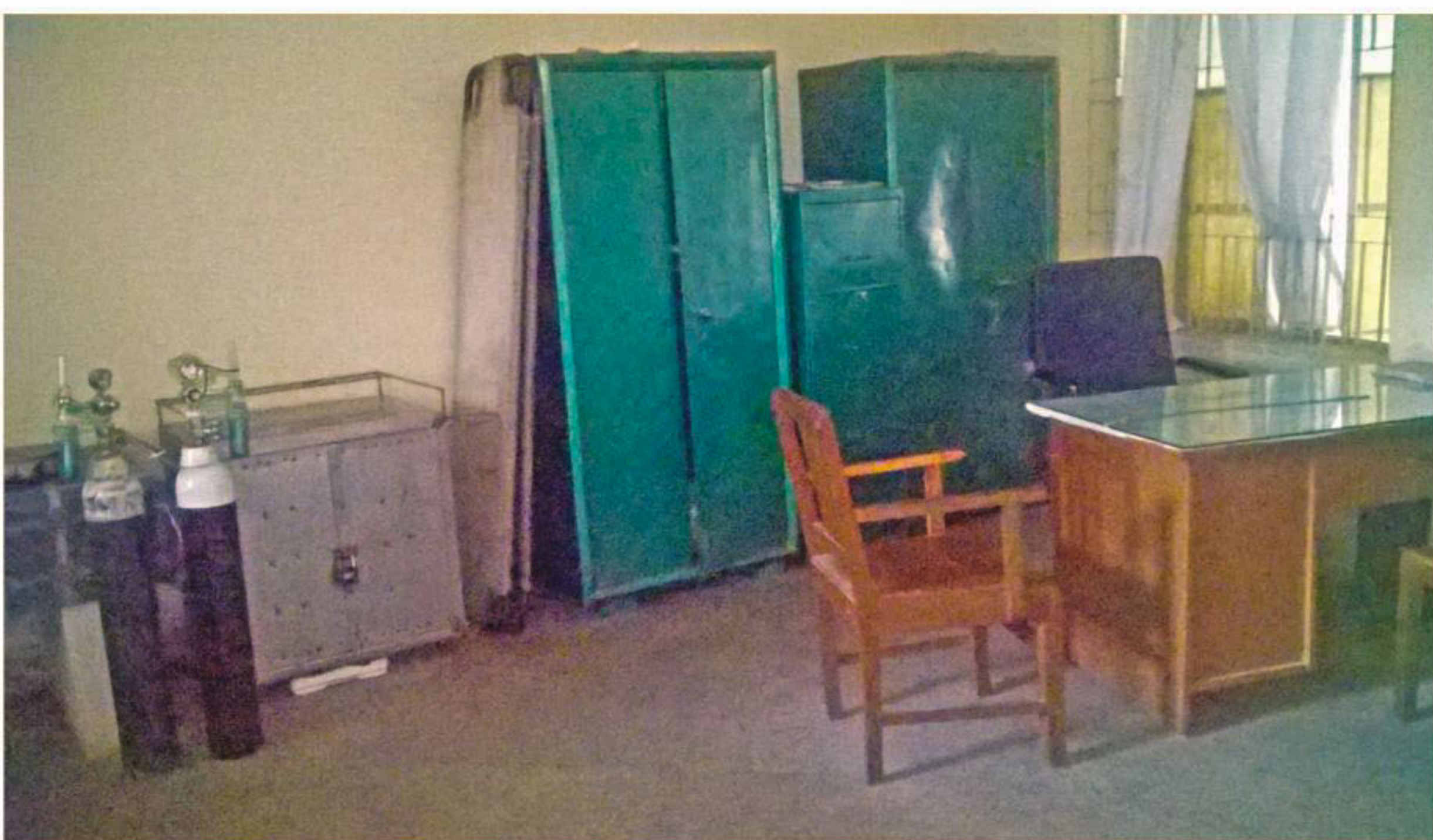
This is pretty much it! Chittagong University Medical Centre! Badly in need of an adequate funding, sufficient manpower, and proper medical equipment.