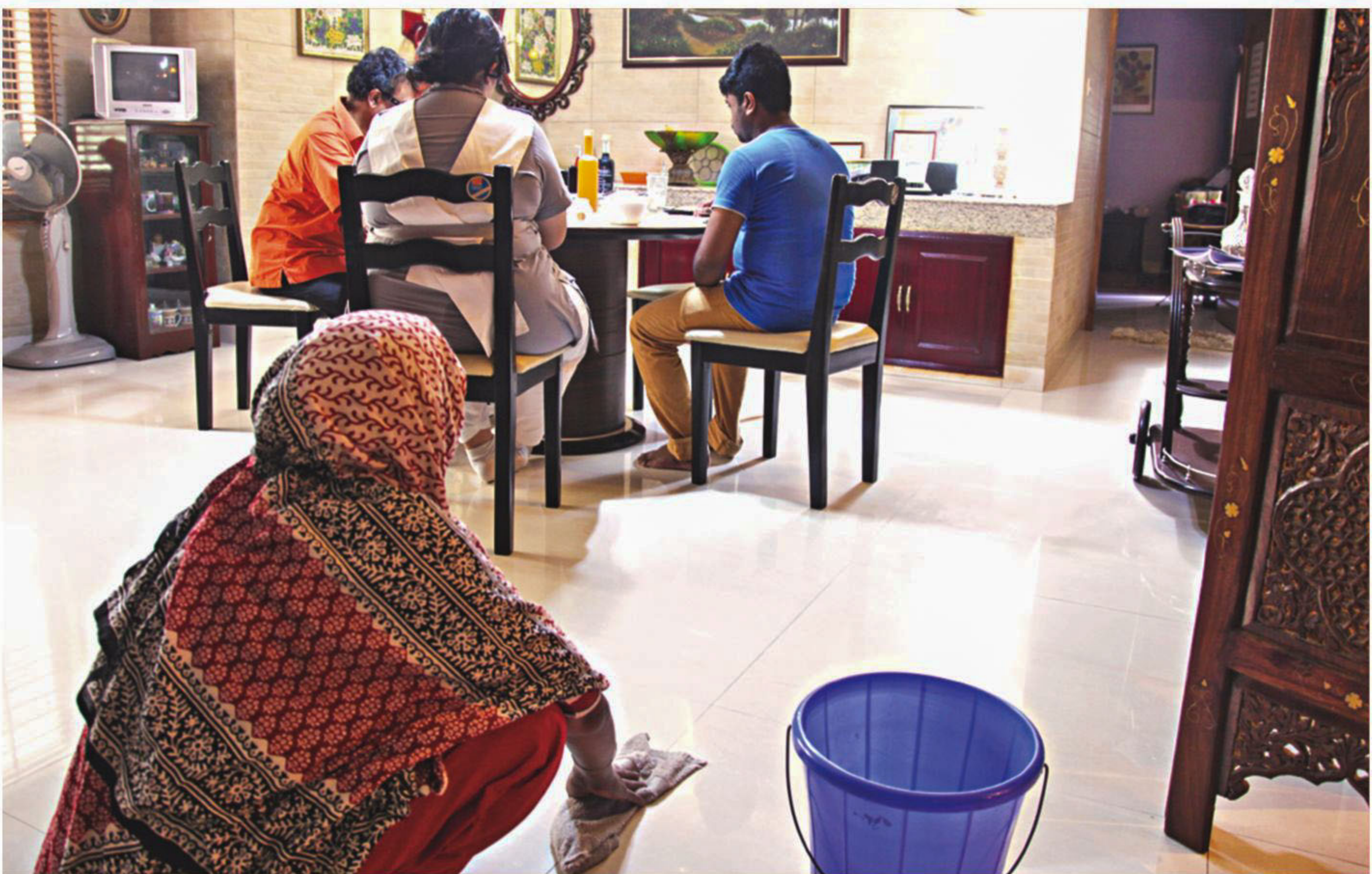
A woman cleans the floor while the family dines. Thousands used to help families like this before and also earn money but they were not considered workers under the Labour Act, hence losing certain benefits and protection. The recognition, however, came last December, and this is the first May Day they are observing as workers. The photo was taken in a Dhaka city apartment recently.

Different media outlets will publish and broadcast special supplements and programmes highlighting the significance of the day.