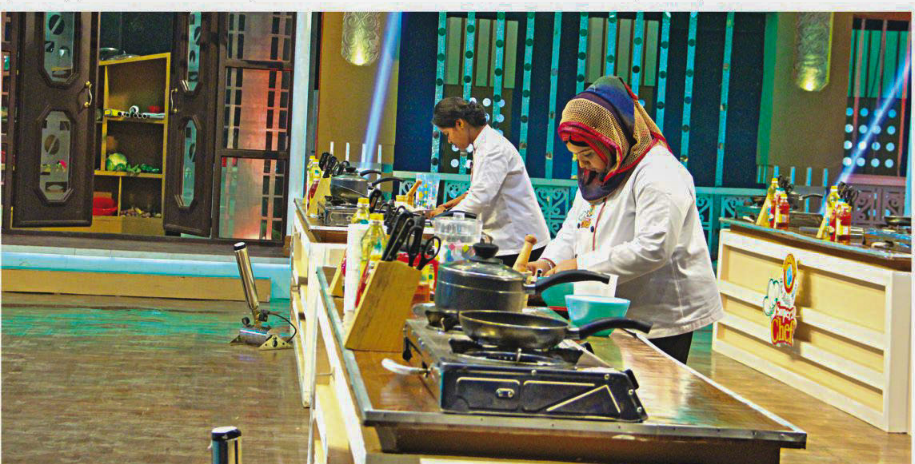
Two contestants deep in concentration at the kitchen.

son and thus this episode promises to be quite a cracker. The top 10 are here but winning this moves them to the next round. The kitchen is still heating up and there seems to be no respite in spite. With the prize money and the Super Chef crown hanging in the balance, a lot is indeed at stake.