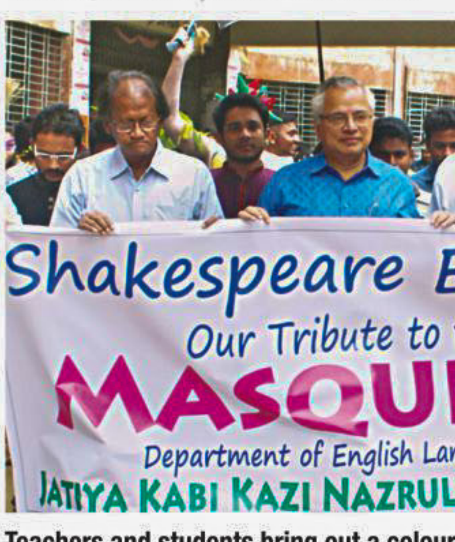
Teachers and students bring out a colourful rally.